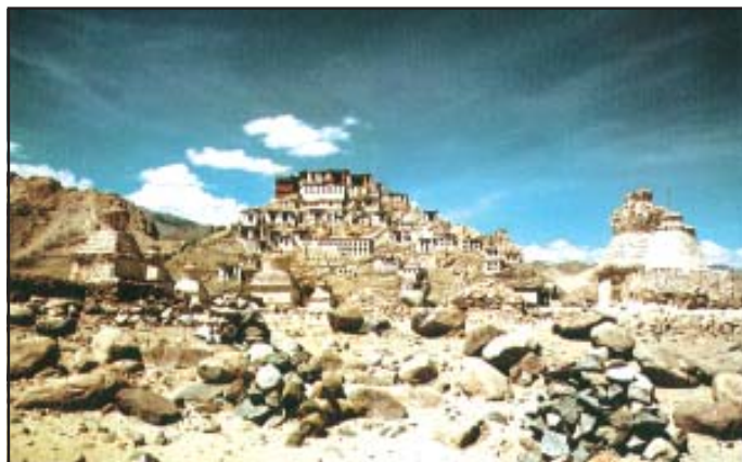
Fig. 10.5 Thiksey Monastery

The finest cricket bats are made from the wood of the willow trees.