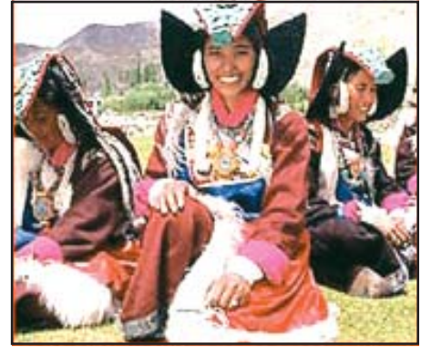
Fig. 10.6. Ladakhi Women in Traditional Dress

Life of people is undergoing change due to modernisation. But the people of Ladakh have over the centuries learned to live in balance and harmony with nature. Due to scarcity of resources like water and fuel, they are used with reverence and care. Nothing is discarded or wasted.