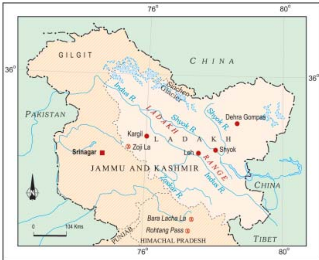
Fig. 10.4: Ladakh

The altitude in Ladakh varies from about 3000m in Kargil to more than 8,000m in the Karakoram. Due to its high altitude, the climate is extremely cold and dry. The air at this altitude is so thin that the heat of the sun can be felt intensely. The day temperatures in summer are just above zero degree and the night temperatures well below -30^{\circ}\text{C} . It is freezing cold in the winters when the temperatures may remain below -40^{\circ}\text{C} for most of the time. As it lies