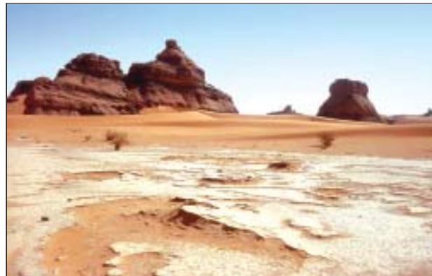
Fig. 10.1: The Sahara Desert

Desert: It is an arid region characterised by extremely high or low temperatures and has scarce vegetation.