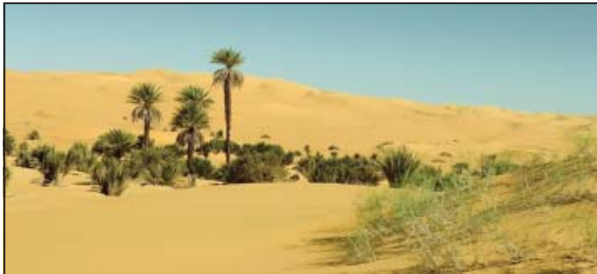
Fig. 10.3: Oasis in the Sahara Desert

snakes and lizards are the prominent animal species living there.