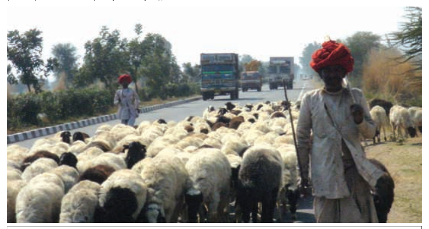
Fig. 18 – A Raika shepherd on Jaipur highway. Heavy traffic on highways has made migration of shepherds a new experience.

Yet, pastoralists do adapt to new times. They change the paths of their annual movement, reduce their cattle numbers, press for rights to enter new areas, exert political pressure on the government for relief, subsidy and other forms of support and demand a right in the management of forests and water resources. Pastoralists are not relics of the past. They are not people who have no place in the modern world. Environmentalists and economists have increasingly come to recognise that pastoral nomadism is a form of life that is perfectly suited to many hilly and dry regions of the world.