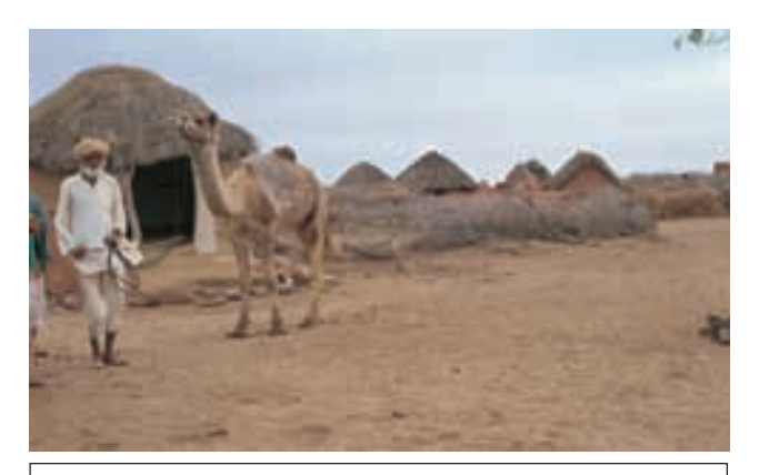
Fig. 6 – A camel herder in his settlement. This is on the Thar desert near Jaisalmer in Rajasthan. The camel herders of the region are Maru (desert) Raikas, and their settlement is called a dhandi.