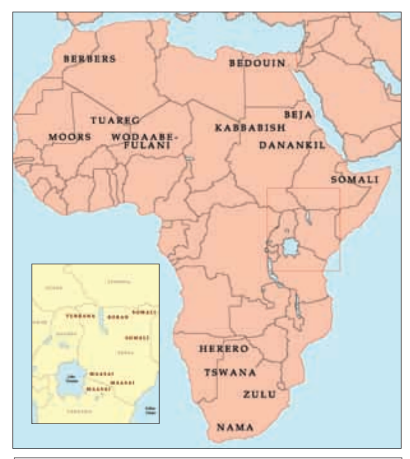
Fig. 13 – Pastoral communities in Africa. The inset shows the location of the Maasais in Kenya and Tanzania.

We will discuss some of these changes by looking at one pastoral community – the Maasai – in some detail. The Maasai cattle herders live primarily in east Africa: 300, 000 in southern Kenya and another 150,000 in Tanzania. We will see how new laws and regulations took away their land and restricted their movement. This affected their lives in times of drought and even reshaped their social relationships.