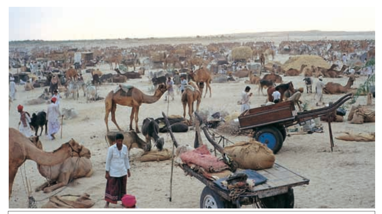
Fig. 7 – A camel fair at Balotra in western Rajasthan. Camel herders come to the fair to sell and buy camels. The Maru Raikas also display their expertise in training their camels. Horses from Gujarat are also brought for sale at this fair.

So we see that the life of these pastoral groups was sustained by a careful consideration of a host of factors. They had to judge how long the herds could stay in one area, and know where they could find water and pasture. They needed to calculate the timing of their movements, and ensure that they could move through different territories. They had to set up a relationship with farmers on the way, so that the herds could graze in harvested fields and manure the soil. They combined a range of different activities – cultivation, trade, and herding – to make their living.