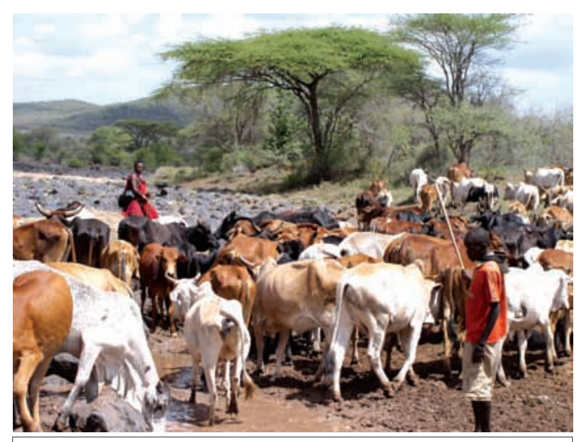
Fig. 15 – The title Maasai derives from the word Maa. Maa-sai means 'My People'. The Maasai are traditionally nomadic and pastoral people who depend on milk and meat for subsistence. High temperatures combine with low rainfall to create conditions which are dry, dusty, and extremely hot. Drought conditions are common in this semi-arid land of equatorial heat. During such times pastoral animals die in large numbes.