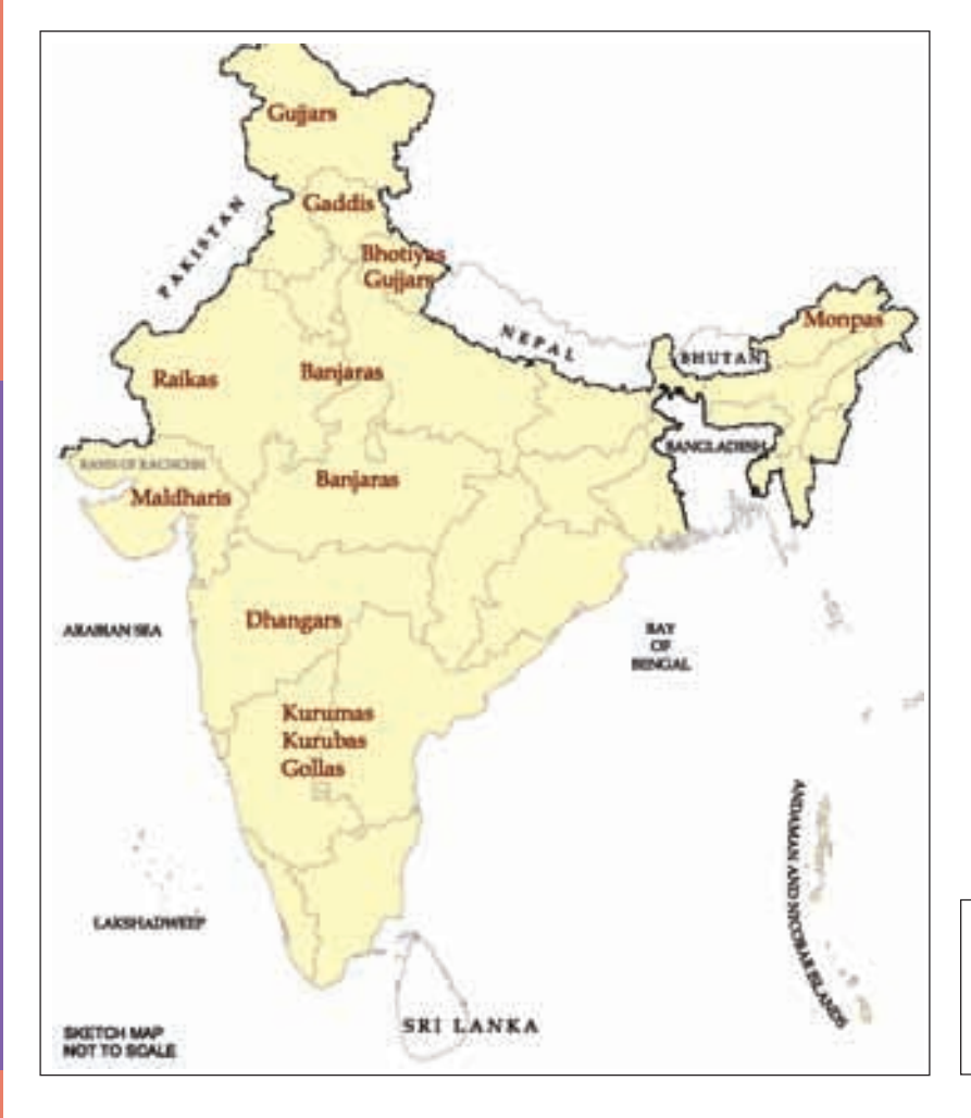
Fig. 11 – Pastoralists in India. This map indicates the location of only those pastoral communities mentioned in the chapter. There are many others living in various parts of India.

As pasturelands disappeared under the plough, the existing animal stock had to feed on whatever grazing land remained. This led to continuous intensive grazing of these pastures. Usually nomadic pastoralists grazed their animals in one area and moved to another area. These pastoral movements allowed time for the natural restoration of vegetation growth. When restrictions were imposed on pastoral movements, grazing lands came to be continuously used and the quality of patures declined. This in turn created a further shortage of forage for animals and the deterioration of animal stock. Underfed cattle died in large numbers during scarcities and famines.