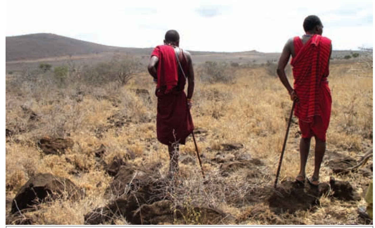
Fig. 14 – Without grass, livestock (cattle, goats and sheep) are malnourished, which means less food available for families and their children. The areas hardest hit by drought and food shortage are in the vicinity of Amboseli National Park, which last year generated approximately 240 million Kenyan Shillings (estimated $3.5 million US) from tourism. In addition, the Kilimanjaro Water Project cuts through the communities of this area but the villagers are barred from using the water for irrigation or for livestock.

Large areas of grazing land were also turned into game reserves like the Maasai Mara and Samburu National Park in Kenya and Serengeti Park in Tanzania. Pastoralists were not allowed to enter these reserves; they could neither hunt animals nor graze their herds in these areas. Very often these reserves were in areas that had traditionally been regular grazing grounds for Maasai herds. The Serengeti National Park, for instance, was created over 14,760 km. of Maasai grazing land.