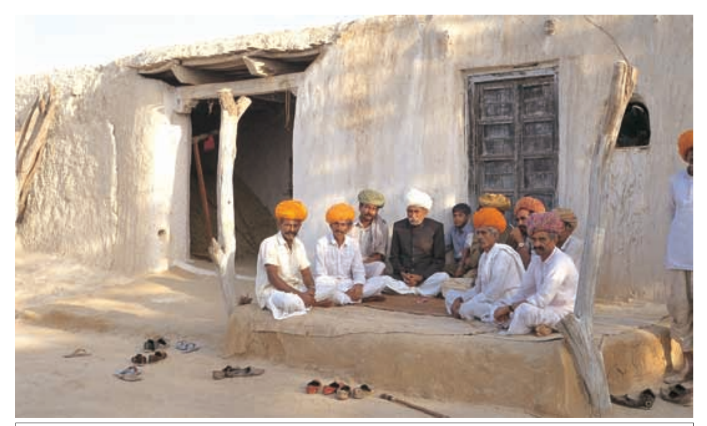
Fig.9 – A Maru Raika genealogist with a group of Raikas. The genealogist recounts the history of the community. Such oral traditions give pastoral groups their own sense of identity. These oral traditions can tell us about how a group looks at its own past.