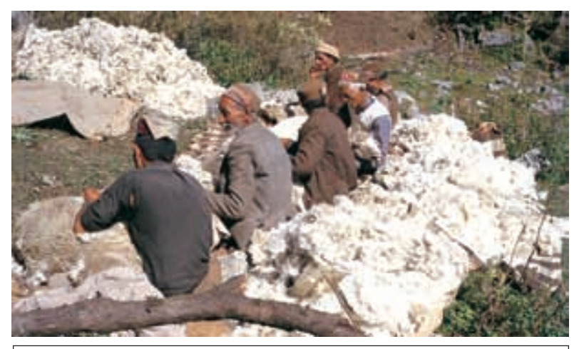
Fig.4 – Gaddi sheep being sheared. By September the Gaddi shepherds come down from the high meadows (Dhars). On the way down they halt for a while to have their sheep sheared. The sheep are bathed and cleaned before the wool is cut.

Bhabar – A dry forested area below the foothills of Garhwal and Kumaun Bugyal – Vast meadows in the high