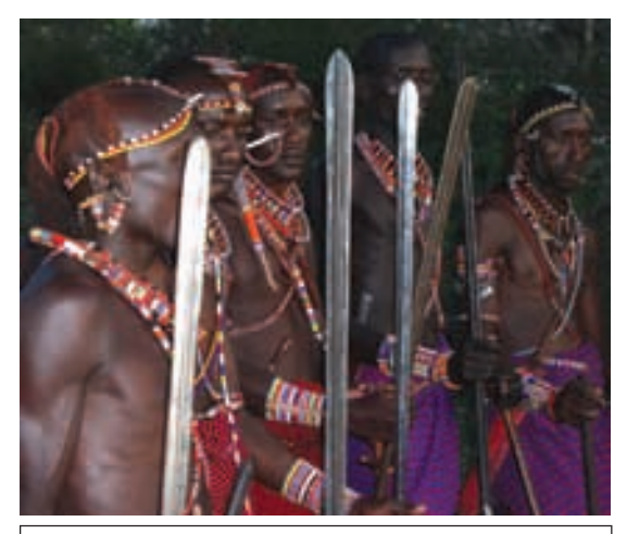
Fig. 16 – Note how the warriors wear traditional deep red shukas, brightly beaded Maasai jewelry and carry five-foot, steel tipped spears. Their long pleats of intricately plaited hair are tinted red with ochre. As per tradition they face East to honour the rising sun. Warriors are in charge of society's security while boys are responsible for herding livestock. During the drought season, both warriors and boys assume responsibility for herding livestock.

In Maasailand, as elsewhere in Africa, not all pastoralists were equally affected by the changes in the colonial period. In pre-colonial times Maasai society was divided into two social categories – elders and warriors. The elders formed the ruling group and met in periodic councils to decide on the affairs of the community and settle disputes. The warriors consisted of younger people, mainly responsible for the protection of the tribe. They defended the community and organised cattle raids. Raiding was important in a society where cattle was wealth. It is through raids that the power of different pastoral groups was asserted. Young men came to be recognised as members of the warrior class when they proved their manliness by raiding the cattle of other pastoral groups and participating in wars. They, however, were subject to the authority of the elders.