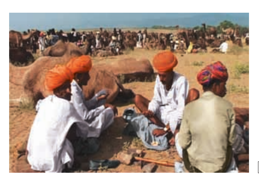
Fig.8 - A camel fair at Pushkar.

How did the life of pastoralists change under colonial rule?