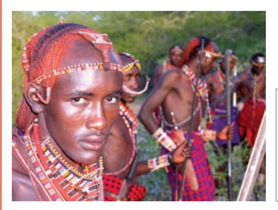
Fig. 17 - Even today, young men go through an elaborate ritual before they become warriors, although actually it is no longer common. They must travel throughout the section's region for about four months, ending with an event where they run to the homestead and enter with an attitude of a raider. During the ceremony, boys dress in loose clothing and dance non-stop throughout the day. This ceremony is the transition into a new age. Girls are not required to go through such a ritual.

To administer the affairs of the Maasai, the British introduced a series of measures that had important implications. They appointed chiefs of different sub-groups of Maasai, who were made responsible for the affairs of the tribe. The British imposed various restrictions on raiding and warfare. Consequently, the traditional authority of both elders and warriors was adversely affected.