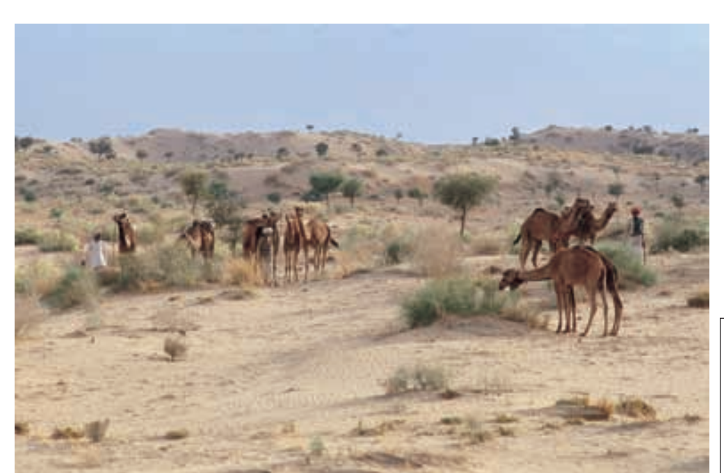
Fig. 5 – Raika camels grazing on the Thar desert in western Rajasthan.

Dhangars were an important pastoral community of Maharashtra. In the early twentieth century their population in this region was estimated to be 467,000. Most of them were shepherds, some were blanket weavers, and still others were buffalo herders. The Dhangar shepherds stayed in the central plateau of Maharashtra during the monsoon. This was a semi-arid region with low rainfall and poor soil. It was covered with thorny scrub. Nothing but dry crops like bajra could be sown here. In the monsoon this tract became a vast grazing ground for the Dhangar flocks. By October the Dhangars harvested their bajra and started on their move west. After a march of about a month they reached the Konkan. This was a flourishing agricultural tract with high rainfall and rich soil. Here the shepherds