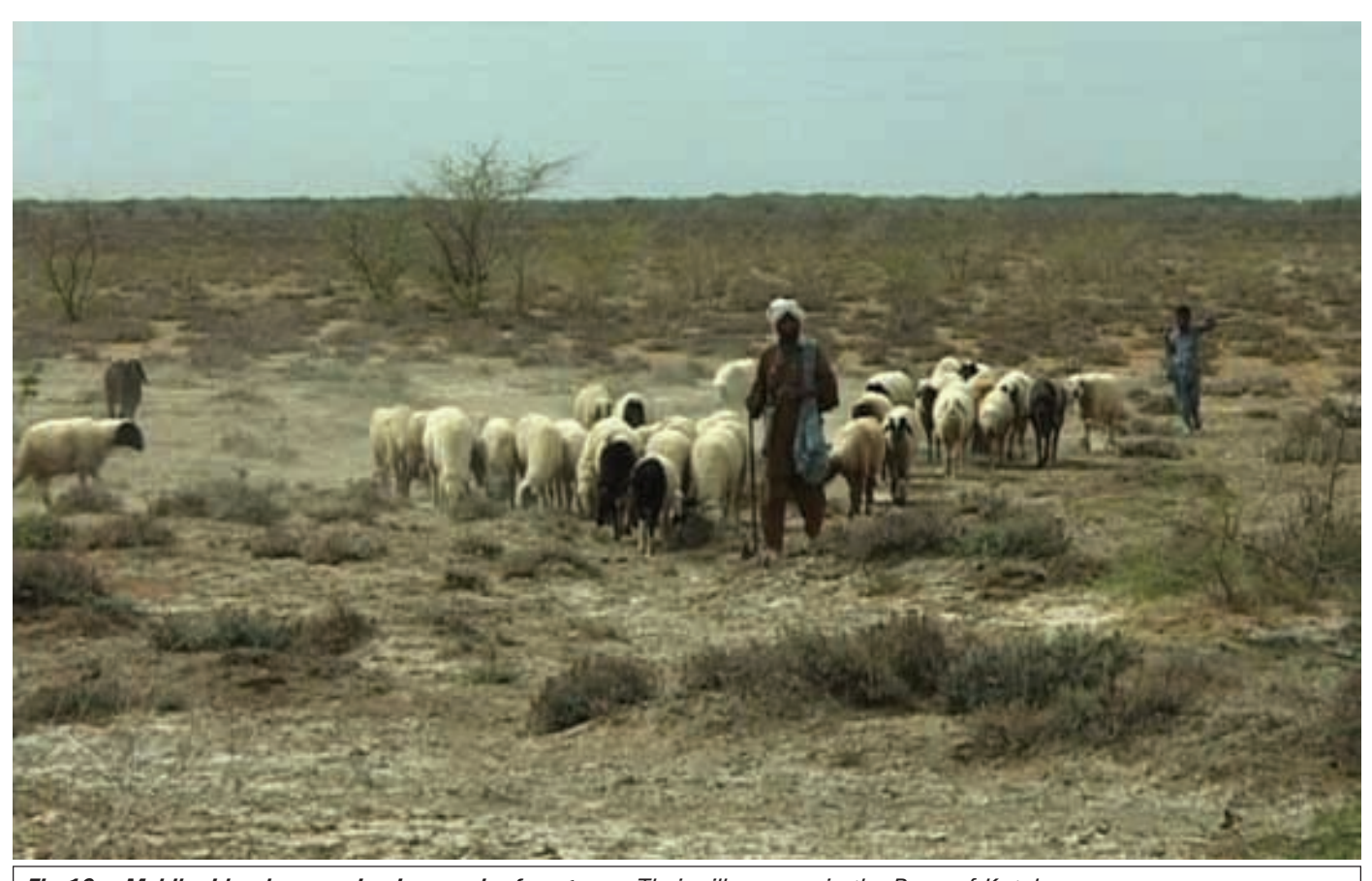
Fig. 10 - Maldhari herders moving in search of pastures. Their villages are in the Rann of Kutch.