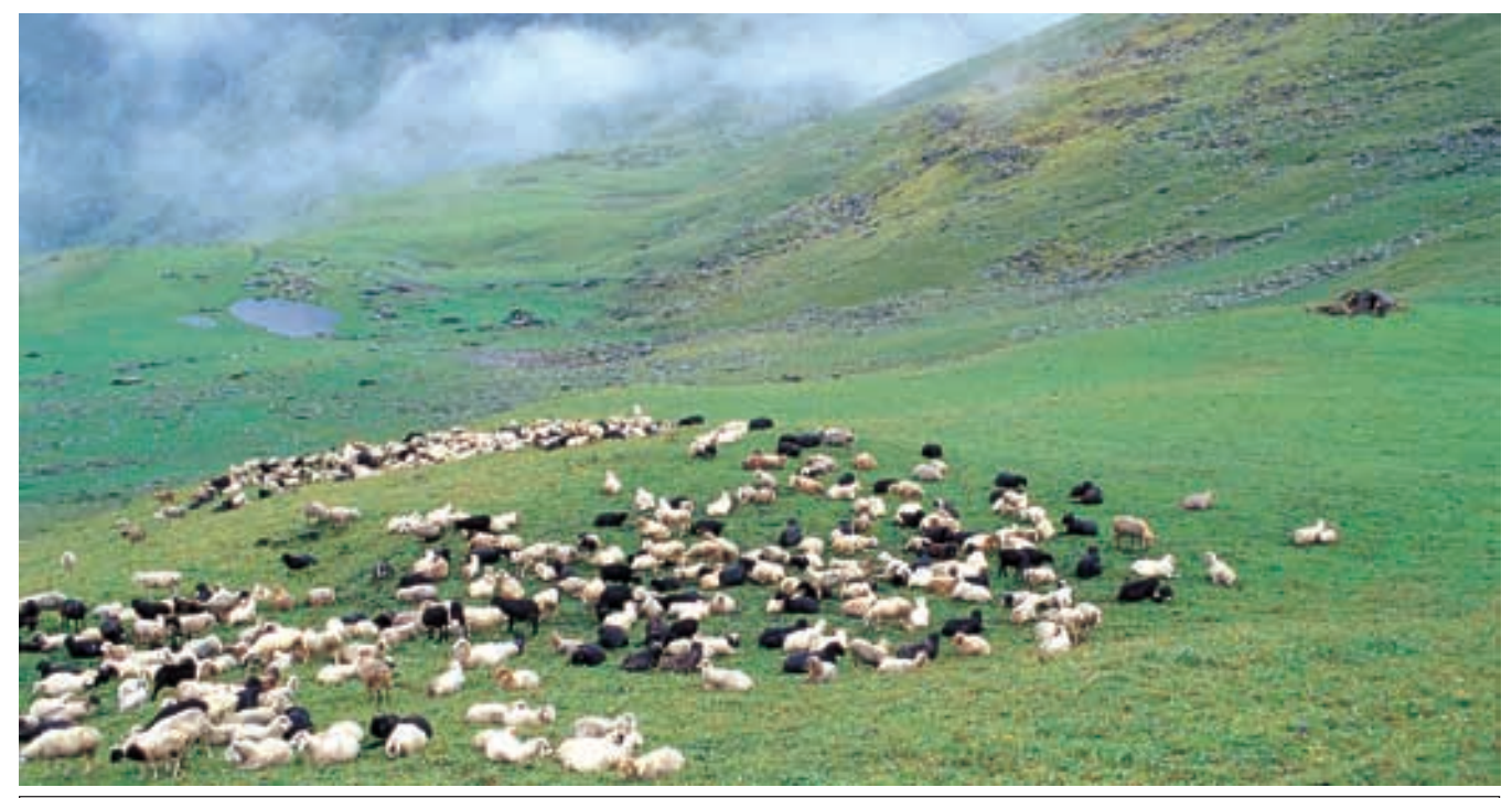
Fig. 1 – Sheep grazing on the Bugyals of eastern Garhwal. Bugyals are vast natural pastures on the high mountains, above 12,000 feet. They are under snow in the winter and come to life after April. At this time the entire mountainside is covered with a variety of grasses, roots and herbs. By monsoon, these pastures are thick with vegetation and carpeted with wild flowers.

In this chapter you will read about nomadic pastoralists. Nomads are people who do not live in one place but move from one area to another to earn their living. In many parts of India we can see nomadic pastoralists on the move with their herds of goats and sheep, or camels and cattle. Have you ever wondered where they are coming from and where they are headed? Do you know how they live and earn? What their past has been?