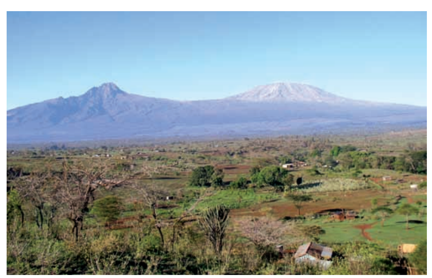
Fig. 12 – A view of Maasai land with Kilimanjaro in the background. Forced by changing conditions, the Maasai have grown dependent on food produced in other areas such as maize meal, rice, potatoes, cabbage. Traditionally the Maasai frowned upon this. Maasai believed that tilling the land for crop farming is a crime against nature. Once you cultivate the land, it is no longer suitable for grazing.

Like pastoralists in India, the lives of African pastoralists have changed dramatically over the colonial and post-colonial periods. What have these changes been?