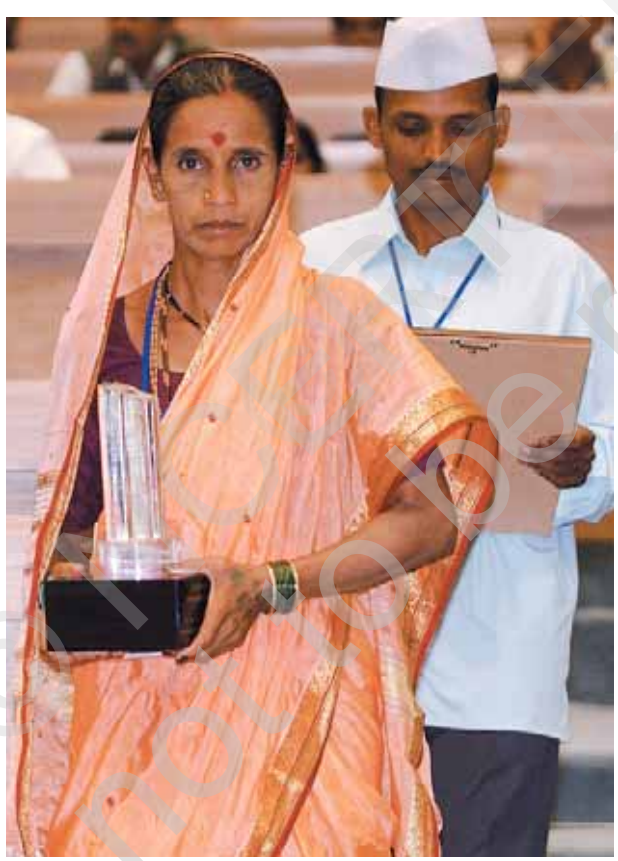
Two village Panchs from Maharashtra who were awarded the Nirmal Gram Puruskar in 2005 for the excellent work done by them in the Panchayat.

In some states, Gram Sabhas form committees like construction and development committees. These committees include some members of the Gram Sabha and some from the Gram Panchayat who work together to carry out specific tasks.