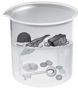
Figure 4.6 Some objects float in water while others sink in it

drops of honey that you let fall into a glass of water. What happens to all of these?