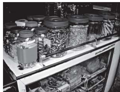
Fig. 4.8 Transparent bottles in a shop

hide behind a glass window? Obviously not, as your friends can see through that and spot you. Can you see through all the materials? Those substances or materials, through which things can be seen, are called transparent (Fig. 4.7). Glass, water, air and some plastics are examples of transparent materials. Shopkeepers usually prefer to keep biscuits, sweets and other eatables in transparent containers of glass or