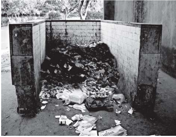
Fig. 16.7 Neighbourhood garbage dump

a few days. In how many days does the bucket become full? You know the number of members in your family. If you find out the population of your city or town, can you now estimate the number of buckets of garbage that may be generated in a day in your city or town? We are generating mountains of garbage everyday, isn't it (Fig. 16.7)?