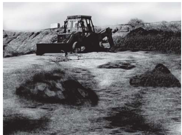
Fig. 16.1 A landfill

There the part of the garbage that can be reused is separated out from the one that cannot be used as such. Thus,