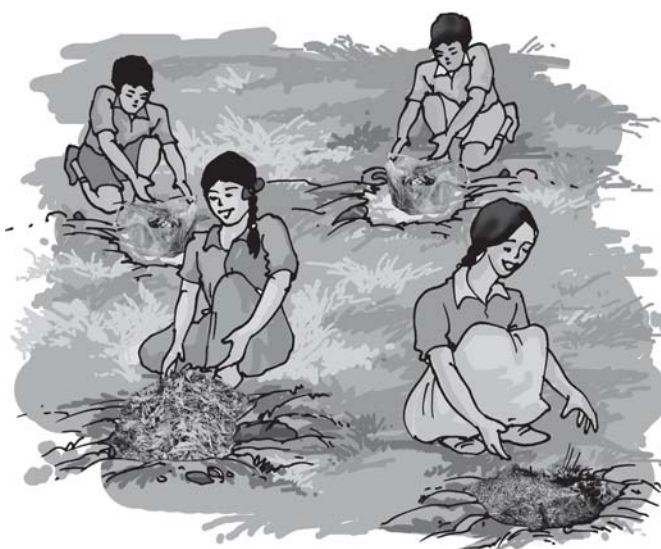
Fig. 16.2 Putting garbage heaps in pits

Now divide the contents of each group into two separate heaps. Label them