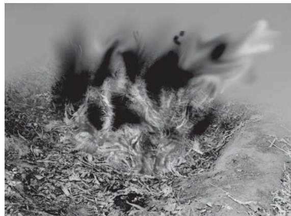
Fig. 16.3 Burning of leaves produce harmful gases

Have you noticed garbage heaps of dried leaves on the roadside? Most of the time these are burnt (Fig. 16.3). Farmers too often burn the husk, dried leaves and part of crop plants in their fields after harvesting. Burning of these, produces smoke and gases that are harmful to our health. We should try to stop such practices. These wastes could be converted into useful compost.