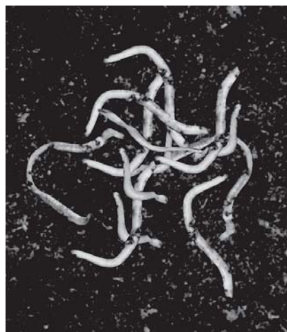
Fig. 16.4 Redworms

Now, your pit is ready to welcome the redworms. Buy some redworms and put them in your pit (Fig. 16.4). Cover them loosely with a gunny bag or an old sheet of cloth or a layer of grass.