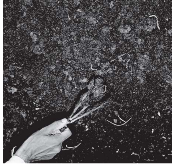
Fig. 16.6 Vermicomposting

Put some wastes as food in one corner of the pit. Most of the worms will shift