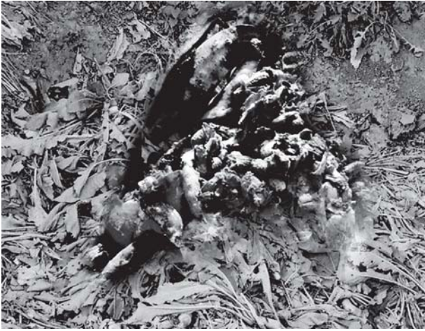
Fig. 16.5 Food for redworms

that may contain salt, pickles, oil, vinegar, meat and milk preparations as food for your redworms. If you put these things in the pit, disease-causing small organisms start growing in the pit. Once in a few days, gently mix and move the top layers of your pit.