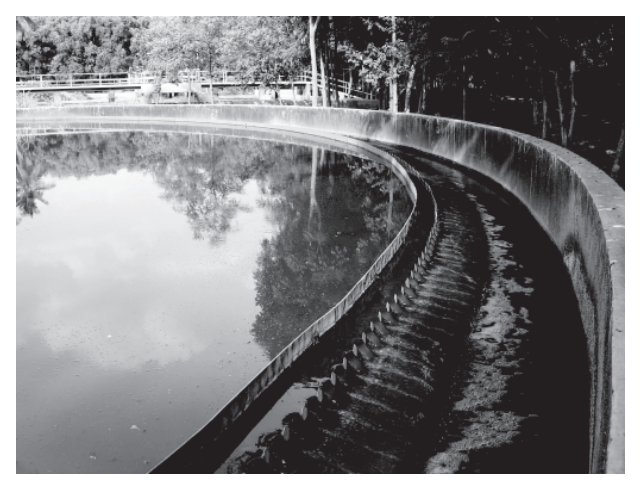
Fig. 18.5 Water clarifer

The sludge is transferred to a separate tank where it is decomposed by the anaerobic bacteria. The biogas produced in the process can be used as fuel or can be used to produce electricity.