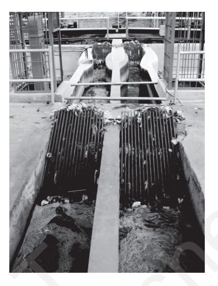
Fig. 18.3 Bar screen

1. Wastewater is passed through bar screens. Large objects like rags, sticks, cans, plastic packets, napkins are removed (Fig. 18.3).