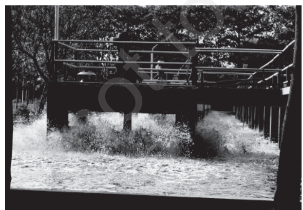
Fig. 18.6 Aerator

After several hours, the suspended microbes settle at the bottom of the tank as activated sludge. The water is then removed from the top.