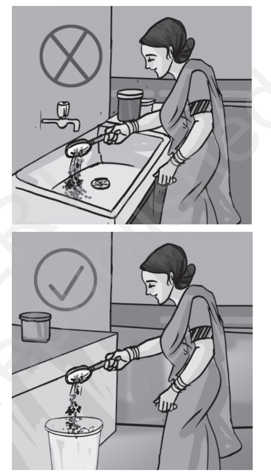
Fig. 18.7 Do not throw every thing in the sink

Used tealeaves, solid food remains, soft toys, cotton, sanitary towels, etc. should also be thrown in the dustbin (Fig. 18.7). These wastes choke the