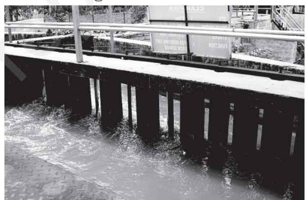
Fig. 18.4 Grit and sand removal tank

2. Water then goes to a grit and sand removal tank. The speed of the incoming wastewater is decreased to allow sand, grit and pebbles to settle down (Fig. 18.4).