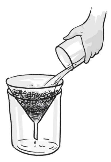
Fig. 18.2 Filtration process

Observe carefully the samples in all the test tubes. Do not taste! Just smell them!