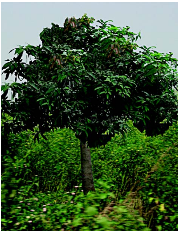
Fig. 7.3 (a) : Wild Mango

Madhavji shows sal and wild mango (Fig. 7.3 (a)) as two examples of the