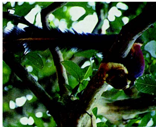
Fig. 7.3 (b) : Giant squirrel

endemic flora of the Pachmarhi Biosphere Reserve. Bison, Indian giant squirrel [Fig. 7.3 (b)] and flying squirrel are endemic fauna of this area. Professor Ahmad explains that the destruction of their habitat, increasing population and introduction of new species may affect the natural habitat of endemic species and endanger their existence.