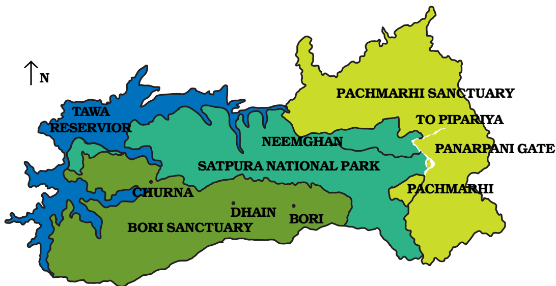
Fig. 7.1 : Pachmarhi Biosphere Reserve