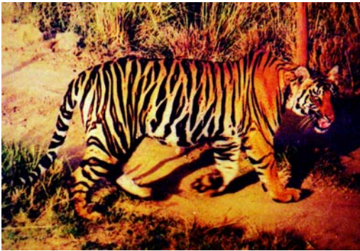
Fig. 7.4 : Tiger

Tiger (Fig. 7.4) is one of the many species which are slowly disappearing from our forests. But, the Satpura Tiger Reserve is unique in the sense that a significant increase in the population of tigers has been seen here. Once upon a time, animals like lions, elephants, wild