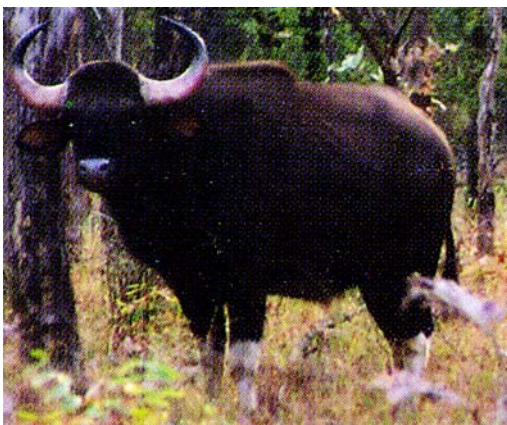
Fig. 7.5 : Wild buffalo

buffaloes (Fig. 7.5) and barasingha (Fig. 7.6) were also found in the Satpura National Park. Animals whose numbers are diminishing to a level that they might face extinction are known as the endangered animals . Boojho is