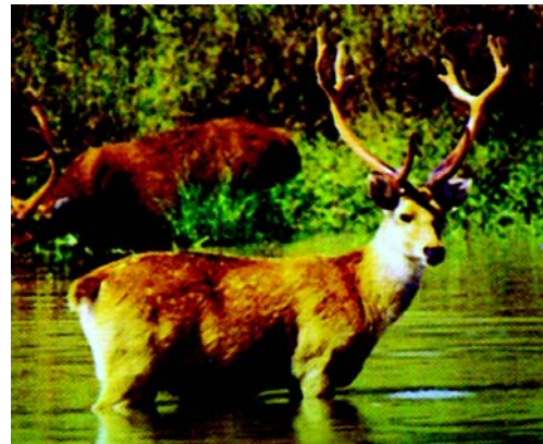
Fig. 7.6 : Barasingha

reminded of the dinosaurs which became extinct a long time ago. Survival of some animals has become difficult because of disturbances in their natural habitat.