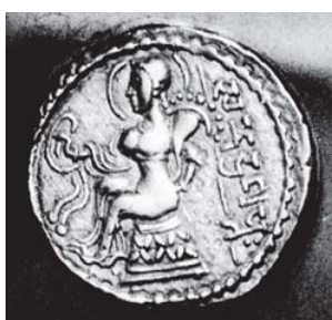
veena. Some other qualities of Samudragupta are shown on coins such as this one, where he is shown playing the veena.