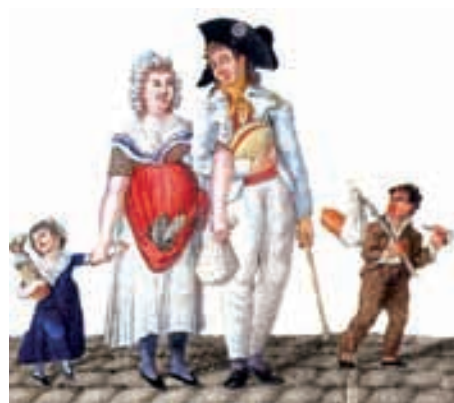
Fig.5 – A sans-culottes family, 1793.

Notice the sumptuous clothing, the elaborate headgear, and the lace edgings on the dress the lady is wearing. She also has a corset inside the dress. This was meant to confine and shape her waist so that she appeared narrow waisted. The nobleman, as was the custom of the time, is wearing a long soldier's coat, knee breeches, silk stockings and high heeled shoes. Both of them have elaborate wigs and both have their faces painted a delicate shade of pink, for the display of natural skin was considered uncultured.