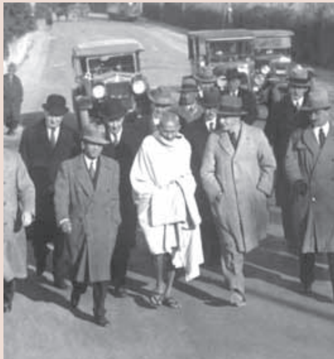
Fig. 31 – On his visit to Europe in 1931. By now his clothes had become a powerful political statement against Western cultural domination.