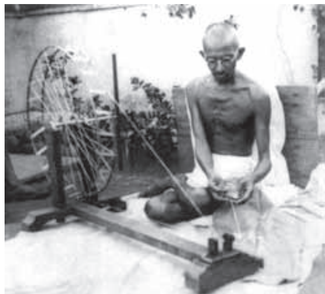
Fig.20 – The familiar image of Mahatma Gandhi, bare chested and at his spinning wheel.

If you were a poor peasant would you have willingly taken to giving up mill-made cloth?