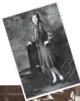
Fig.9 – Changes in clothing in the early twentieth century.

In the late 1870s, heavy, restrictive underclothes, which had created such a storm in the pages of women's magazines, were gradually discarded. Clothes got lighter, shorter and simpler.