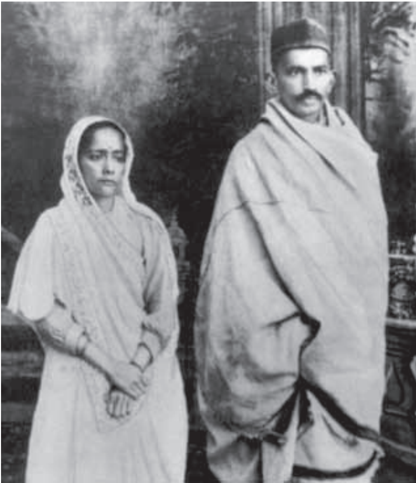
Fig.26 – Mahatma Gandhi with Kasturba, shortly after his return from South Africa. Dressed simply, he later confessed to feeling awkward amongst the Westernised Bombay elite. He said that he was more at home among the labourers in South Africa.

‘I propose to discard at least up to 31st of October my topi and vest and to content myself with a loincloth, and a chaddar whenever necessary for protection of my body. I adopt the change because I have always hesitated to advise anything I may not be prepared to follow ...’