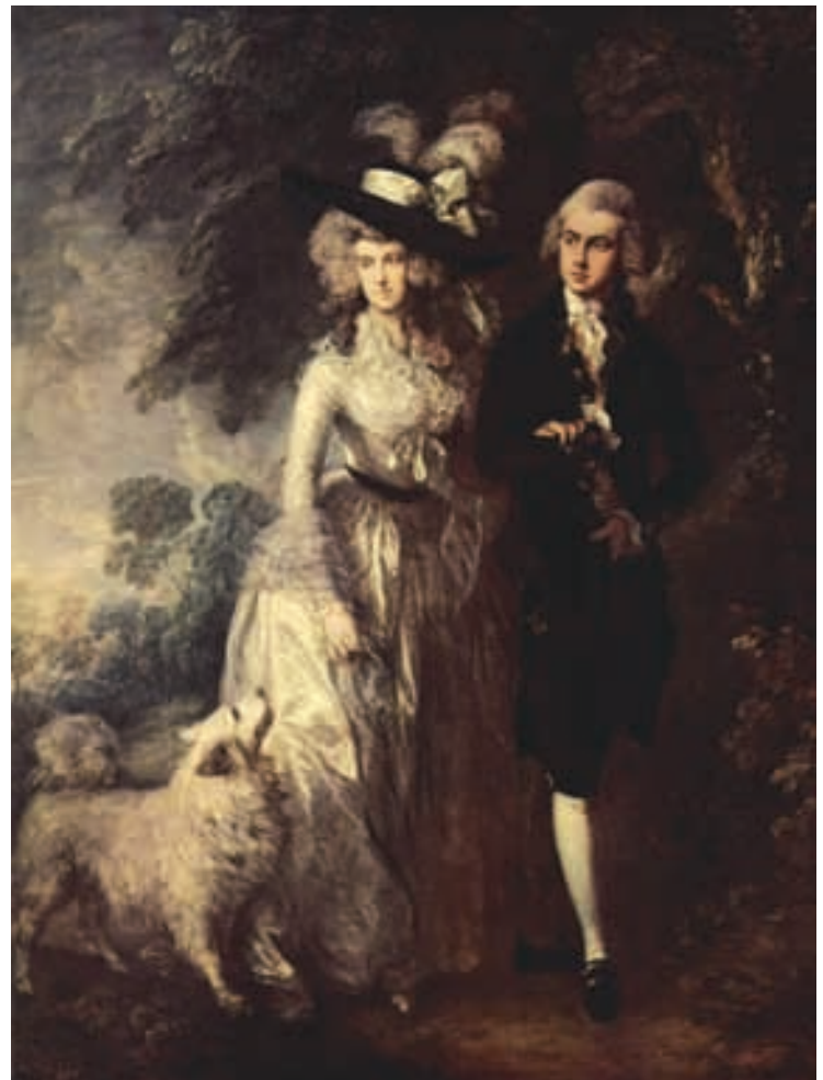
Fig. 1 – An upper-class couple in eighteenth-century England. Painting by the English artist Thomas Gainsborough (1727-1788)