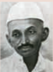
Fig. 29 – 1920. Wearing the Gandhi cap.