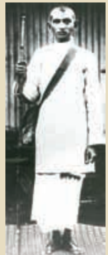
Fig. 25 – In 1913 in South Africa, dressed for Satyagraha