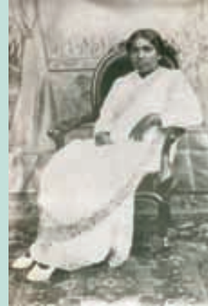
Fig. 19 – Maharani of Travancore (1930). Note the Western shoes and the modest long-sleeved blouse. This style had become common among the upper classes by the early twentieth century.

Soudamini Khastagiri, Striloker Paricchad (1872)