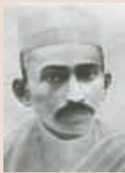
Fig. 28 – 1915. In an embroidered Kashmiri cap.