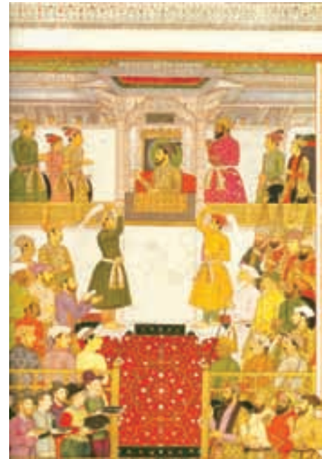
Fig. 14 – Europeans bringing gifts to Shah Jehan, Agra, 1633, from the Padshahnama. Notice the European visitors’ hats at the bottom of the picture, creating a contrast with the turbans of the courtiers.

Today, the Mysore turban is used largely on ceremonial occasions and to honour visiting dignitaries.