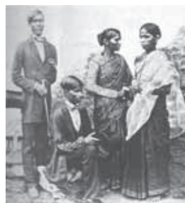
Fig. 11 – Converts to Christianity in Goa in 1907, who have adopted Western dress.