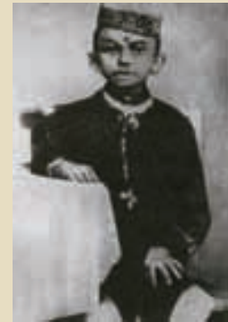
Fig.21 – Mahatma Gandhi in his earliest known picture, aged 7.

On his return to India in 1915, he decided to dress like a Kathiawadi peasant. Only in 1921 did he adopt the short dhoti, the form of dress he wore until his death. On 22 September 1921, a year after launching the non-cooperation movement, which sought swaraj in one year, he announced: