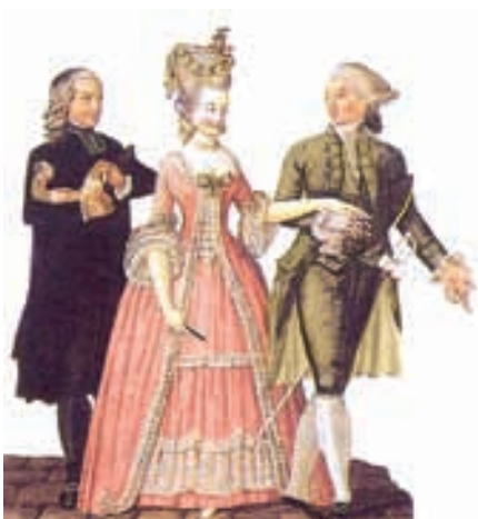
Fig.2 – An aristocratic couple on the eve of the French Revolution.

Notice the sumptuous clothing, the elaborate headgear, and the lace edgings on the dress the lady is wearing. She also has a corset inside the dress. This was meant to confine and shape her waist so that she appeared narrow waisted. The nobleman, as was the custom of the time, is wearing a long soldier's coat, knee breeches, silk stockings and high heeled shoes. Both of them have elaborate wigs and both have their faces painted a delicate shade of pink, for the display of natural skin was considered uncultured.