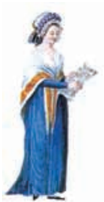
Fig.3 – Woman of the middle classes, 1791.