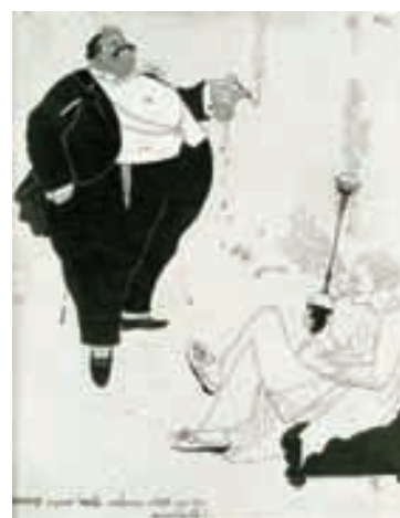
Fig. 12 – Cartoon, 'The Modern Patriot', by Gaganendranath Tagore, early twentieth century. A sarcastic picture of a foolish man who copies western dress but claims to love his motherland with all his heart. The pot-bellied man with cigarette and Western clothes was ridiculed in many cartoons of the time.