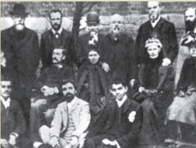
Fig.23 – Mahatma Gandhi (seated front right) London, 1890, at the age of 21. Note the typical Western three-piece suit.