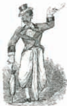
Fig. 13 – Cartoon from Indian Charivari, 1873.

Three. Some men resolved this dilemma by wearing Western clothes without giving up their Indian ones. Many Bengali bureaucrats in the late nineteenth century began stocking western-style clothes for work outside the home and changed into more comfortable Indian clothes at home. Early- twentieth-century anthropologist Verrier Elwin remembered that policemen in Poona who were going off duty would take their