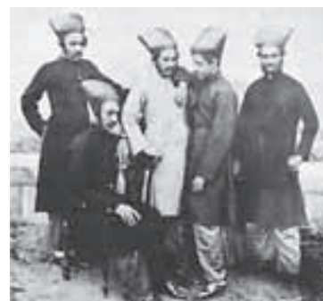
Fig. 10 – Parsis in Bombay, 1863.