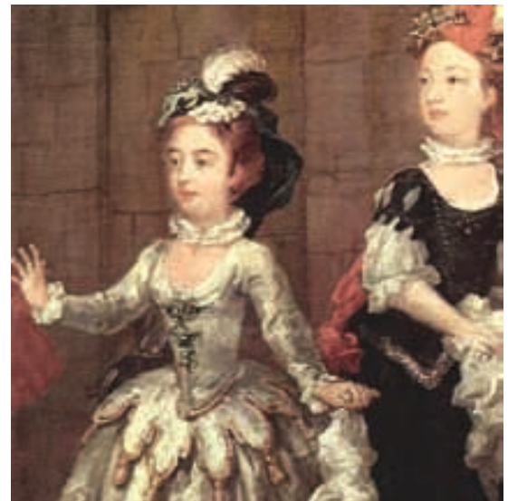
Fig. 7 – A child in an aristocratic household by the English painter William Hogarth (1697-1764). Notice the tiny waist even at this age, probably held in by a corset, and the sweeping gown which would restrict her movement.