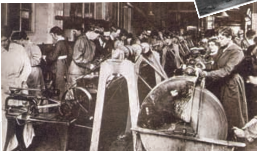
Fig.9b – Women working at a British ammunition factory during the First World War. At this time thousands of women came out to work as war production created a demand for increased labour. The need for easy movement changed clothing styles.

Fig.9a – Even for middle- and upper-class women, clothing styles changed. Skirts became shorter and frills were done away with.