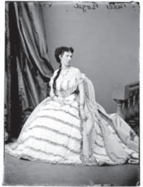
Fig.8 – A woman in nineteenth-century USA, before the dress reforms. Notice the flowing gown sweeping the ground. Reformers reacted to this type of clothing for women.

Mrs Amelia Bloomer, an American, was the first dress reformer to launch loose tunics worn over ankle-length trousers. The trousers were known as 'bloomers', 'rationals', or 'knickerbockers'. The Rational Dress Society was started in England in 1881, but did not achieve significant results. It was the First World War that brought about radical changes in women's clothing.