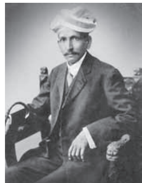
Fig. 15 – Sir M. Visveswaraya. A leading engineer-technocrat and the Dewan of Mysore state from 1912 to 1918. He wore a turban with his three-piece Western style suit.