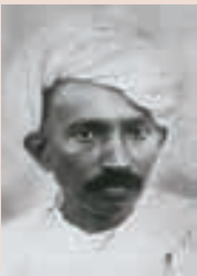
Fig. 27 – 1915. Mahatma Gandhi with a turban.

Large numbers of nationalists defiantly wore the Gandhi cap and were even beaten or arrested for doing so. With the rise of the Khilafat movement in the post-First World War years, the fez, a tasseled Turkish cap, became a sign of anti-colonialism in India. Though many Hindus – as in Hyderabad for instance – also wore the fez, it soon became identified solely with Muslims.