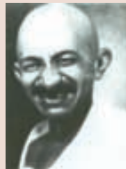
Fig. 30 – 1921. After shaving his head.