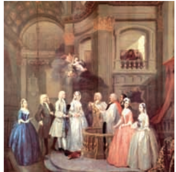
Fig. 6 – Scene at an upper-class wedding by the English painter William Hogarth (1697-1764)

But not everyone accepted these values. Over the nineteenth century, ideas changed. By the 1830s, women in England began agitating for democratic rights. As the suffrage movement developed, many began campaigning for dress reform. Women's magazines described how tight dresses and corsets caused deformities and illness among young