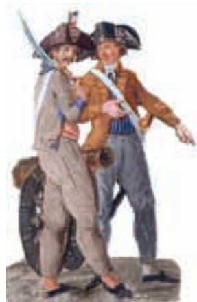
Fig.4 – Volunteers during the French Revolution.