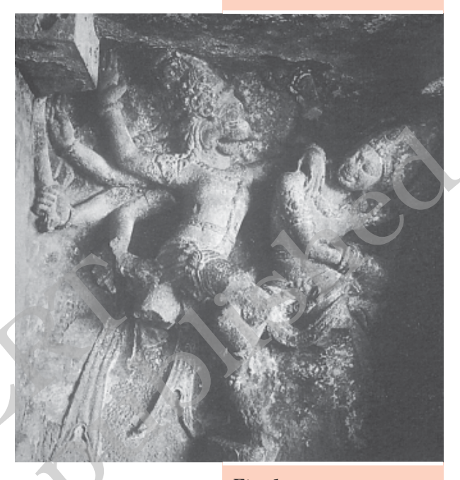
Fig. 1 Wall relief from Cave 15, Ellora, showing Vishnu as Narasimha, the man-lion. It is a work of the Rashtrakuta period.

Many of these new kings adopted high-sounding titles such as maharaja-adhiraja (great king, overlord of kings), tribhuvana-chakravartin (lord of the three worlds) and so on. However, in spite of such claims,