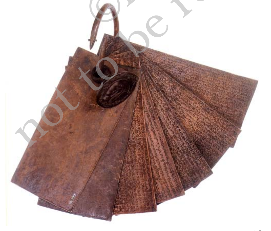
Fig. 2 This is a set of copper plates recording a grant of land made by a ruler in the ninth century, written partly in Sanskrit and partly in Tamil. The ring holding the plates together is secured with the royal seal, to indicate that this is an authentic document.

Kings often rewarded Brahmanas by grants of land. These were recorded on copper plates, which were given to those who received the land.