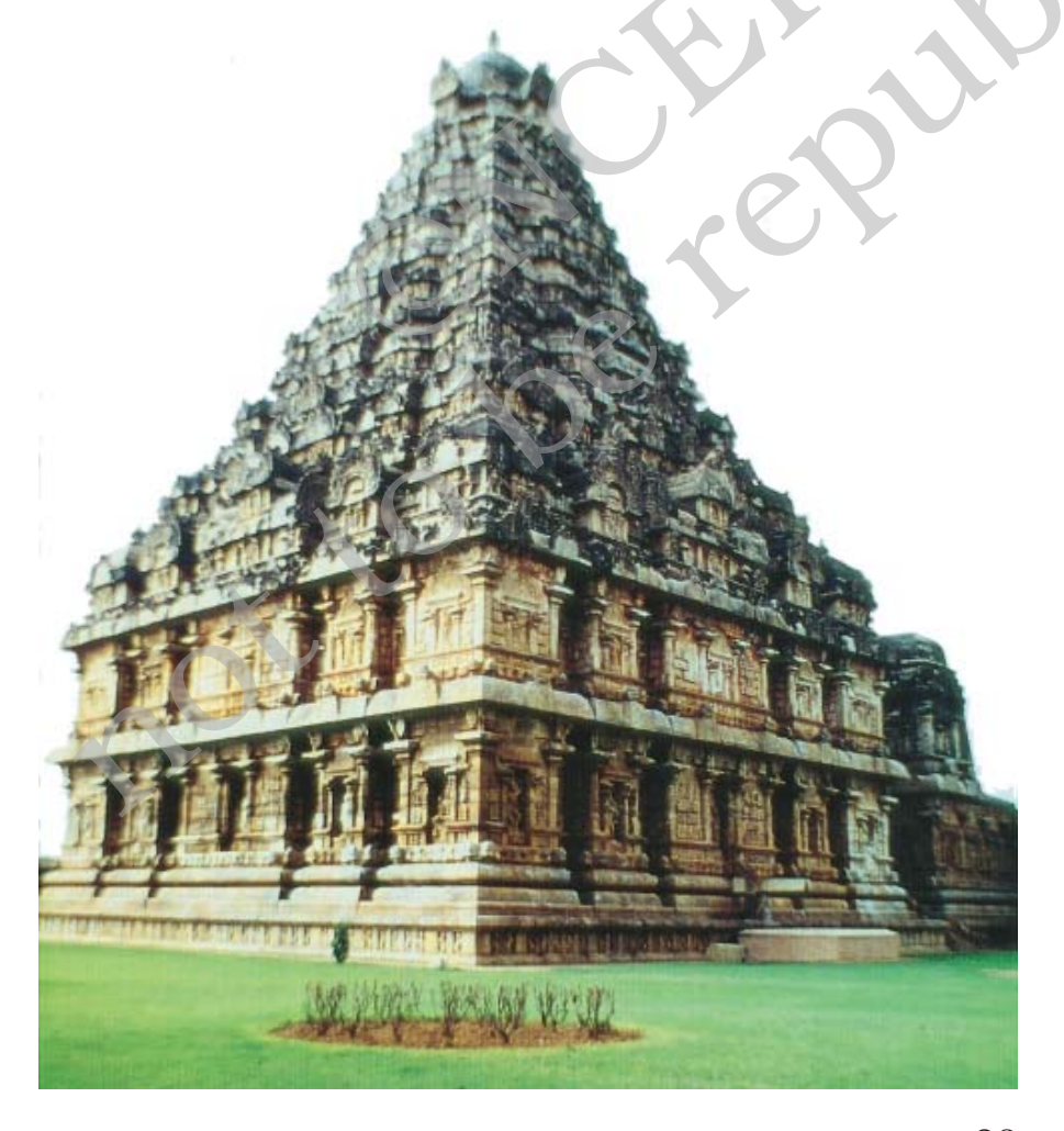
Fig. 3 The temple at Gangaikondacholapuram. Notice the way in which the roof tapers. Also look at the elaborate stone sculptures used to decorate the outer walls.

Chola temples often became the nuclei of settlements which grew around them. These were centres of craft production. Temples were also endowed with land by rulers as well as by others. The produce of this land