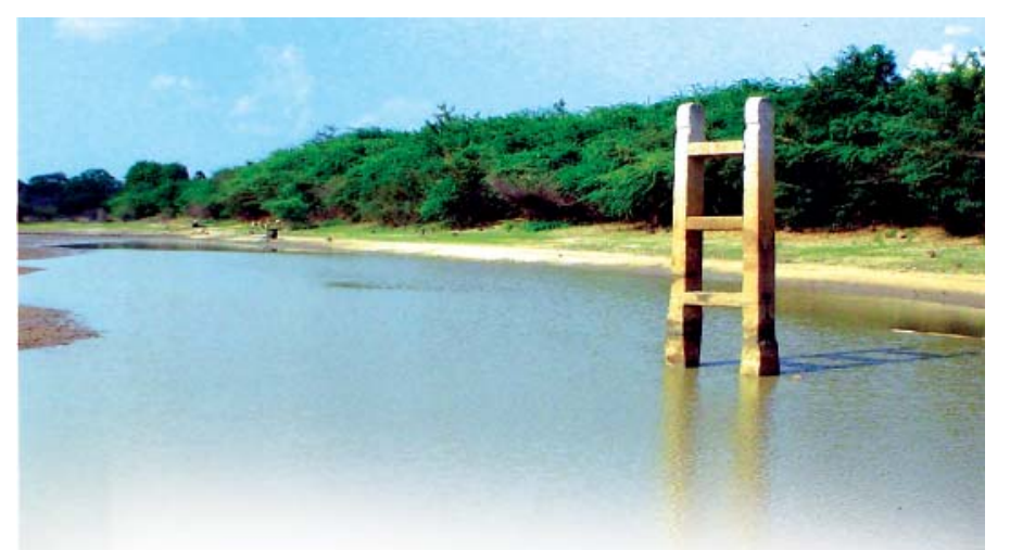
flooding and canals had to be constructed to carry water to the fields. In many areas two crops were grown in a year.