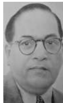
Baba Saheb Dr Ambedkar is known as the Father of the Indian Constitution.

The vast number of communities in India meant that a system of government needed to be devised that did not involve only persons sitting in the capital city of New Delhi and making