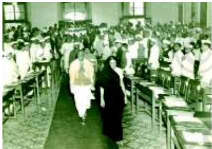
There was an extraordinary sense of unity amongst the members of the Constituent Assembly. Each of the provisions of the future constitution was discussed in great detail and there was a sincere effort to compromise and reach an agreement through consensus. The above photo shows Sardar Vallabhbhai Patel, a prominent member of the Constituent Assembly.

By the beginning of the twentieth century, the Indian national movement had been active in the struggle for independence from British rule for several decades. During the freedom struggle the nationalists had devoted a great deal of time to imagining and planning what a free India would be like. Under the British, they had been forced to obey rules that they had had very little role in making. The long experience of authoritarian rule under the colonial state convinced Indians that free India should be a democracy in which everyone should be treated equally and be allowed to participate in government. What remained to be done then was to work out the ways in which a democratic government would be set up in India and the rules that would determine its functioning. This was done not by one person but by a group of around 300 people who became members of the Constituent Assembly in 1946 and who met periodically for the next three years to write India's Constitution.