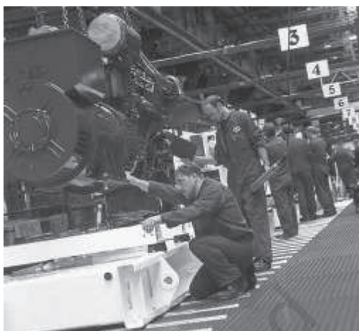
Fig. 5.3 Scientific and technical manpower: a rich ingredient of human capital

Empirical evidence to prove that increase in human capital causes economic growth is rather nebulous. This may be because of measurement problems. For example, education measured in terms of years of schooling, teacher-pupil ratio and enrolment rates may not reflect the quality of education; health services measured in monetary terms, life expectancy and mortality rates may not reflect the true health status of the people in a country. Using the indicators mentioned above, an analysis of improvement in education and health sectors and growth in real per capita income in both developing and developed countries shows that there is convergence in the measures of human capital but no sign of convergence of per capita real income. In other words, the human capital growth in developing countries has been faster but the growth of per capita real income has not been that fast. There are reasons to believe that the