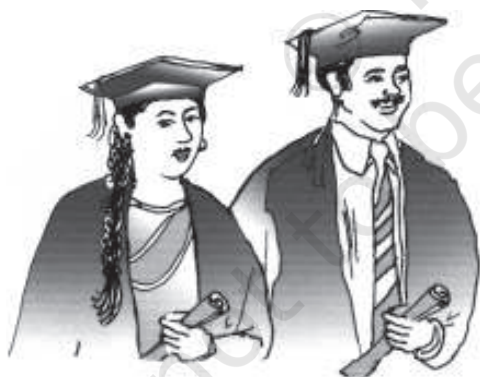
Fig. 5.7 Higher Education: few takers

The differences in literacy rates between males and females are narrowing signifying a positive development in gender equity; still the need to promote education for women in India is imminent for various reasons such as improving economic independence and social status of women and also because women education makes a favourable impact on fertility rate and health care of women and children. Therefore, we cannot be complacent about the upward movement in the literacy rates and we have miles to go in achieving cent per cent adult literacy.