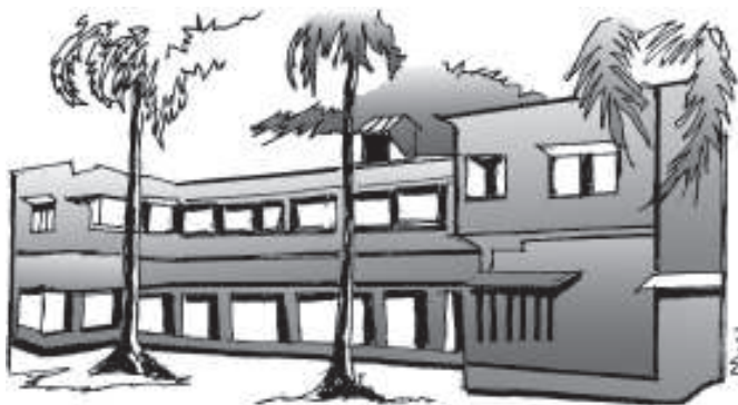
Fig. 5.5 Investment in educational infrastructure is inevitable

Himachal Pradesh to as low as Rs 2200 in Punjab. This leads to differences in educational opportunities and attainments across states.