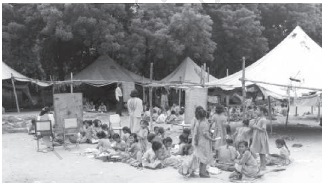
Fig. 5.2 Creating human capital: a school being run in make shift premises in Delhi

uninterrupted labour supply for a longer period of time, then health is also an important factor for economic growth. Thus, both education and health, along with many other factors like on-the-job training, job market information and migration, increase an