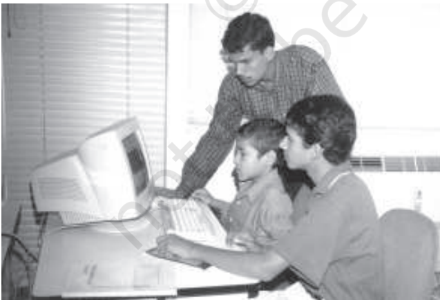
Fig. 5.4 Job on hand: transforming India into a knowledge economy

World Bank, in its recent report, 'India and the Knowledge Economy — Leveraging Strengths and Opportunities', states that India should make a transition to the knowledge economy and if it uses its knowledge as much as Ireland does (it is judged that Ireland uses its knowledge economy very effectively), then the per capita income of India will increase from a little over US $1000 in