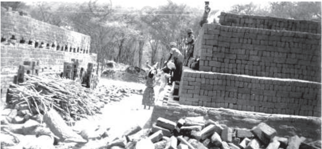
Fig. 5.6 School dropouts give way to child labour: a loss to human capital

Dream: Though literacy rates for both — adults as well as youth — have increased, still the absolute number of illiterates in India is as much as India's population was at the time of independence. In 1950, when the Constitution of India was passed by the Constituent Assembly, it was noted in