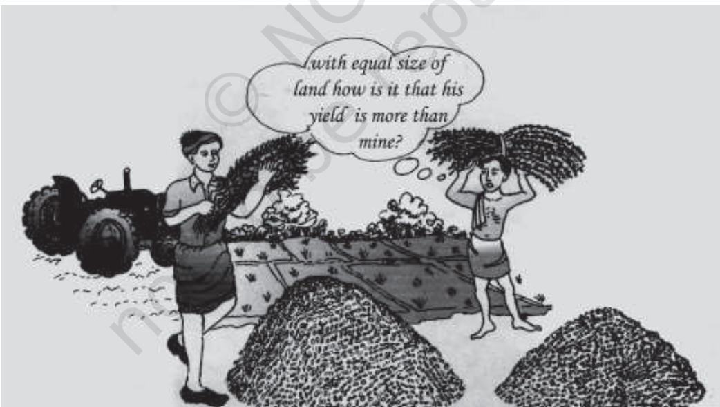
Fig. 5.1 Adequate education and training to farmers can raise productivity in farms

Education is sought not only as it confers higher earning capacity on people but also for its other highly valued benefits: it gives one a better social standing and pride; it enables one to make better choices in life; it provides knowledge to understand the changes taking place in society; it also stimulates innovations. Moreover, the availability of educated labour force facilitates adaptation of new