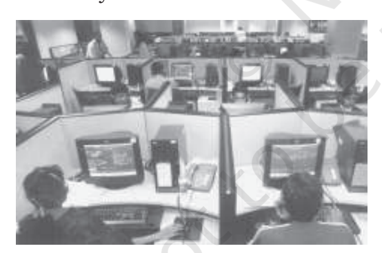
Fig. 3.2 IT Industry is seen as a major contributor to India's exports

Some scholars question the usefulness of India being a member of the WTO as a major volume of international trade occurs among the developed nations. They also say that while developed countries file complaints over agricultural subsidies given in their countries, developing countries feel cheated as they are forced to open up their markets for developed countries but are not allowed access to the markets of developed countries. What do you think?