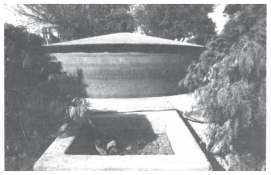
Fig.9.4 Gobar Gas Plant uses cattle dung to produce energy

Wind Power: In areas where speed of wind is usually high, wind mills can provide electricity without any adverse impact on the environment. Wind turbines move with the wind and electricity is generated. No doubt, the initial cost is high. But the benefits are such that the high cost gets easily absorbed.