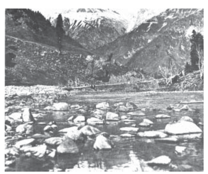
Fig. 9.1 Water bodies: small, snow-fed Himalayan streams are the few fresh-water sources that remain unpolluted.

functions is within its carrying capacity . This implies that the resource extraction is not above the rate of regeneration of the resource and the wastes generated are within the assimilating capacity of the environment. When this is not so, the environment fails to perform its third and vital function of life sustenance and