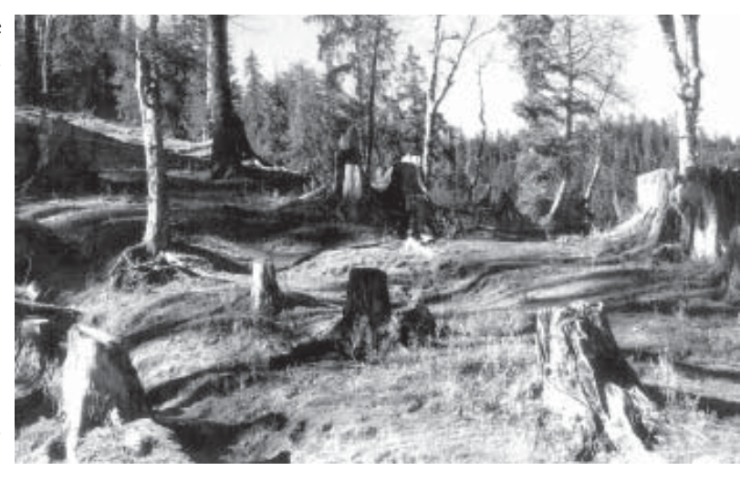
Fig. 9.3 Deforestation leads to land degradation, biodiversity loss and air pollution

deposits beneath the land surface, vast stretch of the Indian Ocean, ranges of mountains, etc. The black soil of the Deccan Plateau is particularly suitable for cultivation of cotton, leading to concentration of textile industries in this region. The Indo-Gangetic plains spread from the Arabian Sea to the Bay of Bengal — are one of the most fertile, intensively cultivated and densely populated regions in the world. India's forests, though unevenly distributed, provide green cover for a majority of its population and natural cover for its wildlife. Large deposits of iron-ore, coal and natural gas are found in the country. India alone accounts for nearly 20 per cent of the world's total iron-ore reserves. Bauxite, copper, chromate, diamonds, gold, lead, lignite, manganese, zinc, uranium, etc. are also available in different parts of the country. However, the developmental activities in India have resulted in