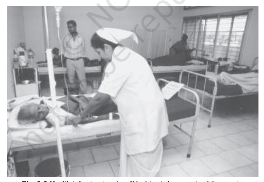
Fig. 8.9 Health infrastructure is still lacking in large parts of the country

State of Health Infrastructure: The government has the constitutional obligation to guide and regulate all