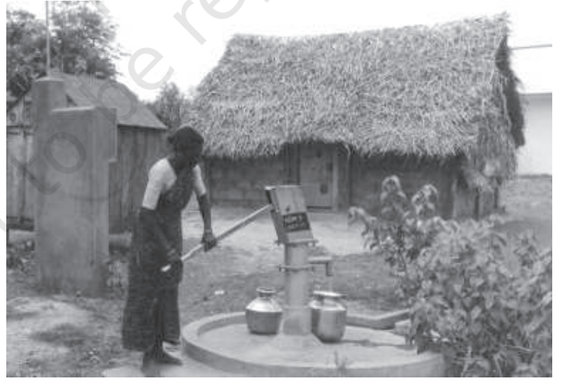
Fig. 8.4 Safe drinking water with pucca house: still a dream

Look at Table 8.1 which shows the state of some infrastructure in India in comparison to a few other countries. Though it is widely understood that infrastructure is the foundation of development, India is yet to wake up to the call. India invests only 5 per cent