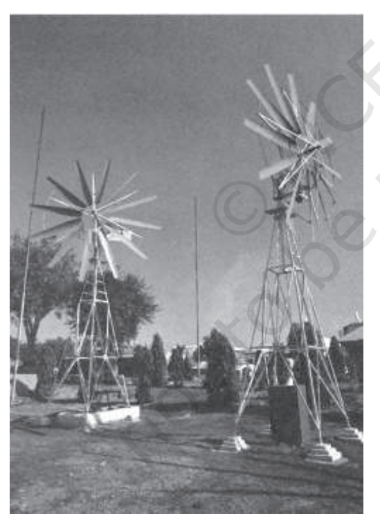
Fig. 8.7 Wind mill: another source of generating power

effective technologies that are already available are used. Even cheaper technologies can be developed.