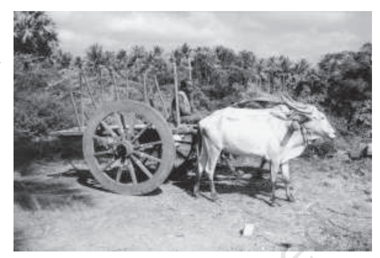
Fig. 8.6 Bullock carts still play a crucial role in rural transportation market

scale in agriculture and related areas like production and transportation of fertilisers, pesticides and farm equipment. It is required in houses for cooking, household lighting and heating. Can you think of producing a commodity or service without using energy?