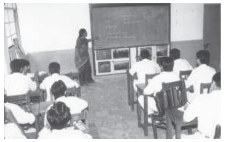
Fig. 8.2 Schools: an important infrastructure for a nation

Some divide infrastructure into two categories — economic and social. Infrastructure associated with energy, transportation and communication are included in the former category whereas those related to education, health and housing are included in the latter.