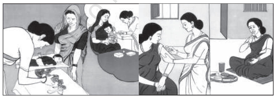
Fig. 8.10 Despite availing of various healthcare measures, maternal health is cause for concern

The poorest 20 per cent of Indians living in both urban and rural areas spend 12 per cent of their income on healthcare while the rich spend only 2 per cent. What happens when the poor fall sick? Many have to sell their land or even pledge their children to afford treatment. Since government-run hospitals do not provide sufficient