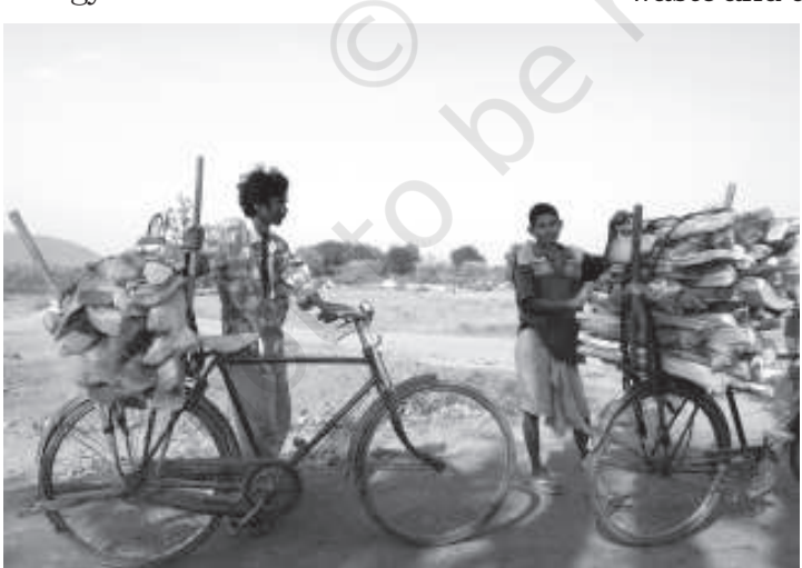
Fig. 8.5 Fuel wood is the major source of energy

While commercial sources of energy are generally exhaustible (with the exception of hydropower), noncommercial sources are generally renewable. More than 60 per cent of households Indian depend on traditional sources of energy for meeting their regular cooking and heating needs.