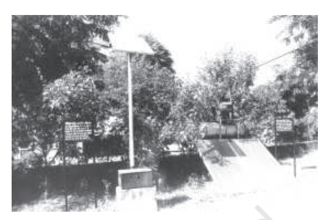
Fig. 8.8 Solar energy has great prospects