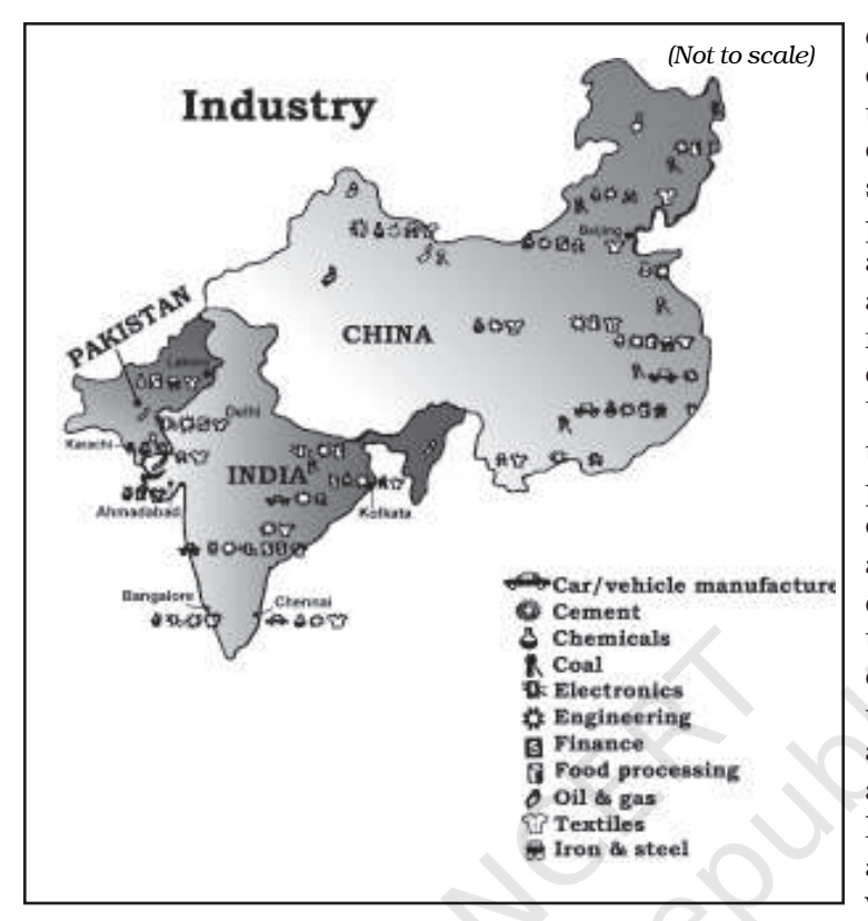
Fig. 10.3 Industry in India, China and Pakistan.

China's growth rates whereas Pakistan met with drastic decline at 4.4 per cent. Some scholars hold the reform processes introduced in 1988 in Pakistan and political instability as reasons behind this trend. We will study in a later section which sector contributed to this trend in these countries.