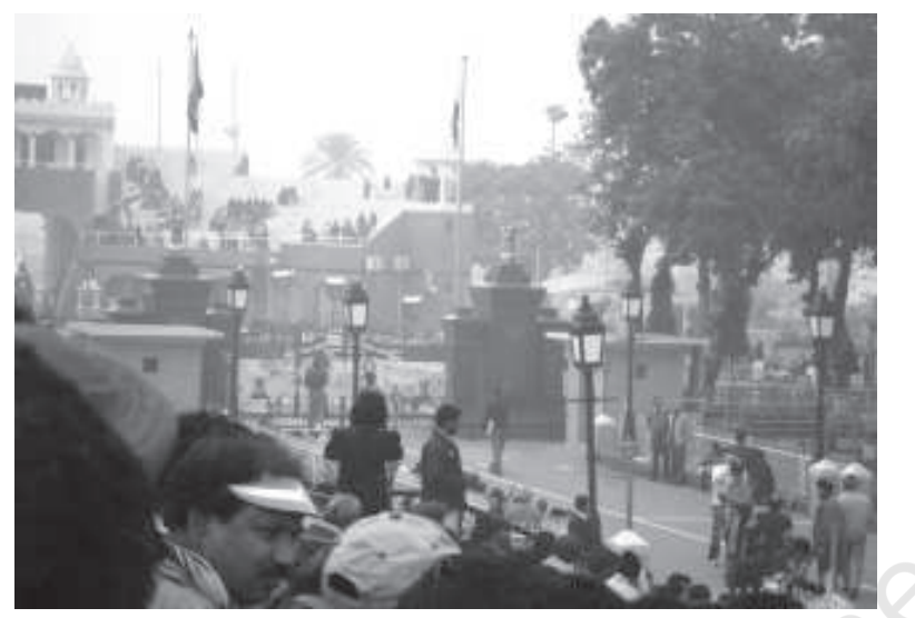
Fig. 10.1 Wagah Border is not only a tourist place but also used for trade between India and Pakistan

goods. At this stage, enterprises owned by government (known as State Owned Enterprises—SOEs), which we, in India, call public sector enterprises, were made to face competition. The reform process also involved dual pricing. This means fixing the prices in two ways; farmers and industrial units were required to buy and sell fixed quantities of inputs and outputs on the basis of prices fixed by the government and the rest were purchased and sold at market prices. Over the years, as production increased, the proportion of goods or inputs transacted in the market also increased. In order to attract foreign investors, special economic zones were set up.