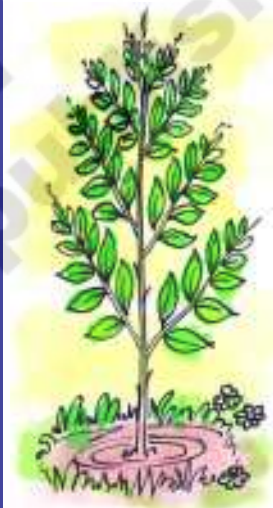
Plant - 1