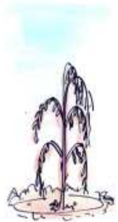
Plant - 2