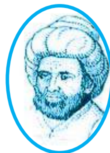
Muhammad ibn Musa al-Khwarizmi (A.D. 780 – 850)

A lemma is a proven statement used for proving another statement.