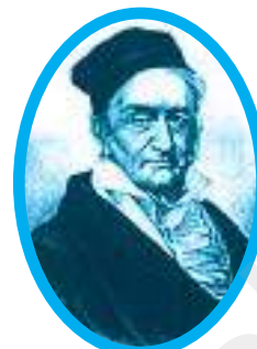
Carl Friedrich Gauss (1777 – 1855)

Carl Friedrich Gauss is often referred to as the 'Prince of Mathematicians' and is considered one of the three greatest mathematicians of all time, along with Archimedes and Newton. He has made fundamental contributions to both mathematics and science.