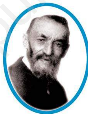
G. Peano (1858-1932)

In contrast to deduction, inductive reasoning depends on working with each case, and developing a conjecture by observing incidences till we have observed each and every case. It is frequently used in mathematics and is a key aspect of scientific reasoning, where collecting and analysing data is the norm. Thus, in simple language, we can say the word induction means the generalisation from particular cases or facts.