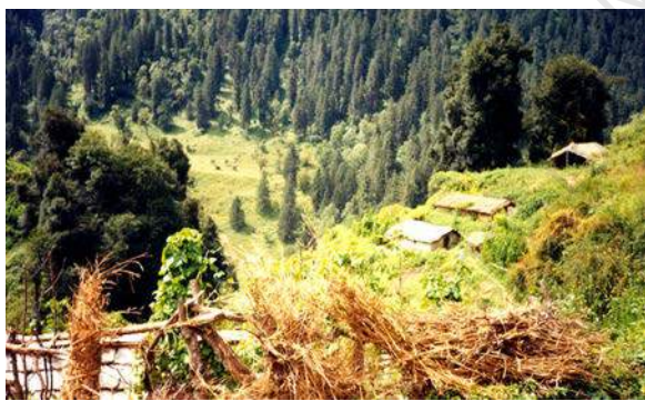
Figure 16.2 A view of a forest life

Do you think such use of forest resources would lead to the exhaustion of these resources? Do not forget that before the British came and took over most of our forest areas, people had been living in these forests for centuries. They had developed practices to ensure that the resources were used in a sustainable manner. After the British took control of the forests (which they exploited ruthlessly for their own purposes), these people were forced to depend on much smaller areas and forest resources started becoming over-exploited to some extent. The Forest Department in independent India took over from the British but local knowledge and local needs continued to be ignored in the management practices. Thus vast tracts of forests have been converted to monocultures of pine, teak or eucalyptus. In order to plant these trees, huge areas are first cleared of all vegetation. This destroys a large amount of biodiversity in the area. Not only this, the varied needs of the local people – leaves for fodder, herbs for medicines, fruits and nuts for food – can no longer be met from such forests. Such plantations are useful for the industries to access specific products and are an important source of revenue for the Forest Department.