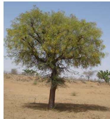
Figure 16.3 Khejri Tree

We need to accept that human intervention has been very much a part of the forest landscape. What has to be managed in the nature and what may be the extent of this intervention? Forest resources ought to be used in a manner that is both environmentally and developmentally sound – in other words, while the environment is preserved, the benefits of the controlled exploitation go to the local people, a process in which decentralised economic growth and ecological conservation go hand in hand. The kind of economic and social development we want will ultimately determine whether the environment will be conserved or further destroyed. The environment must not be regarded as a pristine collection of plants and animals. It is a vast and complex entity that offers a range of natural resources for our use. We need to use these resources with due caution for our economic and social growth, and to meet our material aspirations.