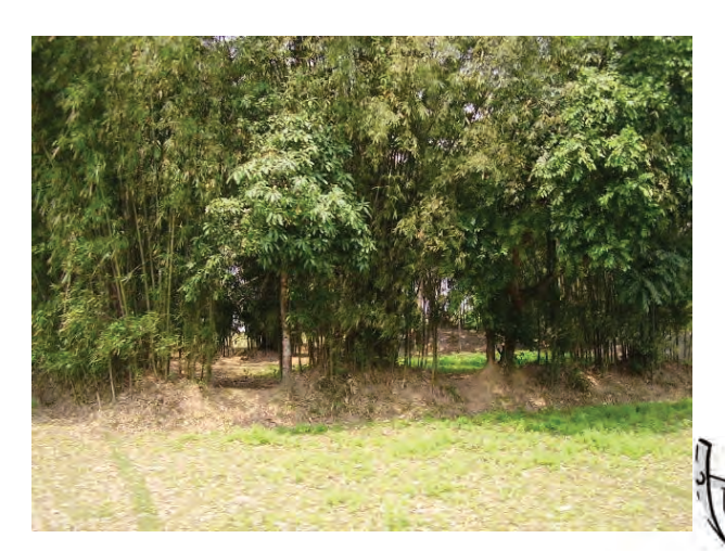
Fig. 4.3: Bamboo plantation in North-east