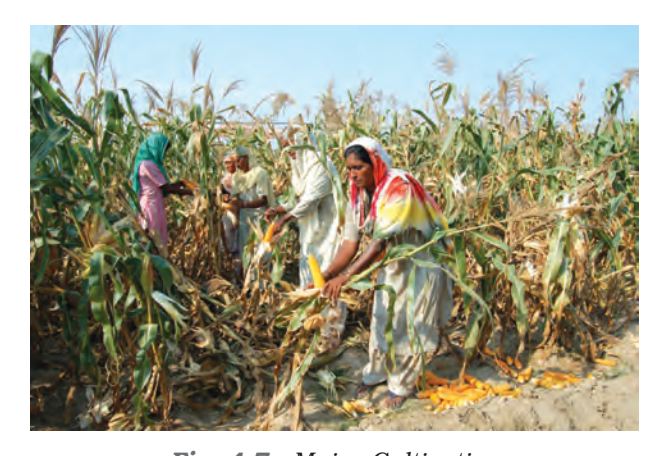
Fig. 4.7: Maize Cultivation

Maize: It is a crop which is used both as food and fodder. It is a kharif crop which requires temperature between 21°C to 27°C and grows well in old alluvial soil. In some states like Bihar maize is grown in rabi season also. Use of modern inputs such as HYV seeds, fertilisers and irrigation have contributed to the increasing production of maize. Major maize-producing states are Karnataka, Madhya Pradesh, Uttar Pradesh, Bihar, Andhra Pradesh and Telangana.