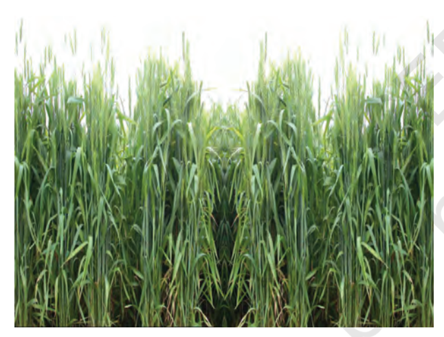
Fig. 4.5: Wheat Cultivation

Wheat: This is the second most important cereal crop. It is the main food crop, in north and north-western part of the country. This rabi crop requires a cool growing season and a bright sunshine at the time of ripening. It requires 50 to 75 cm of annual rainfall evenly-distributed over the growing season. There are two important wheat-growing zones in the country – the Ganga-Satluj plains in the north-west and black soil region of the Deccan. The major wheat-producing states are Punjab, Haryana, Uttar Pradesh, Madhya Pradesh, Bihar and Rajasthan.