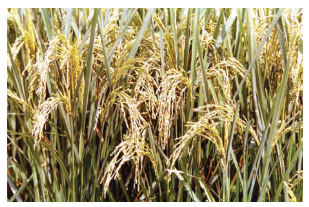
Fig. 4.4 (b): Rice is ready to be harvested in the field