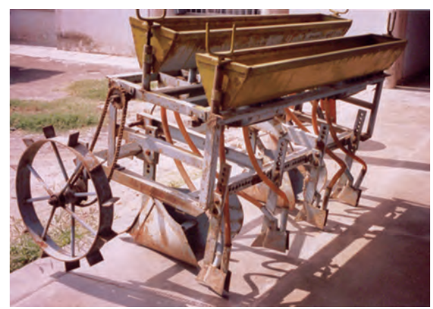
Fig. 4.15: Modern technological equipments used in agriculture

some of the strategies initiated to improve the lot of Indian agriculture. But, this too led to the concentration of development in few selected areas. Therefore, in the 1980s and 1990s, a comprehensive land development programme was initiated, which included both institutional and technical reforms. Provision for crop insurance against drought, flood, cyclone, fire and disease, establishment of Grameen banks, cooperative societies and banks for providing loan facilities to the farmers at lower rates of interest were some important steps in this direction.