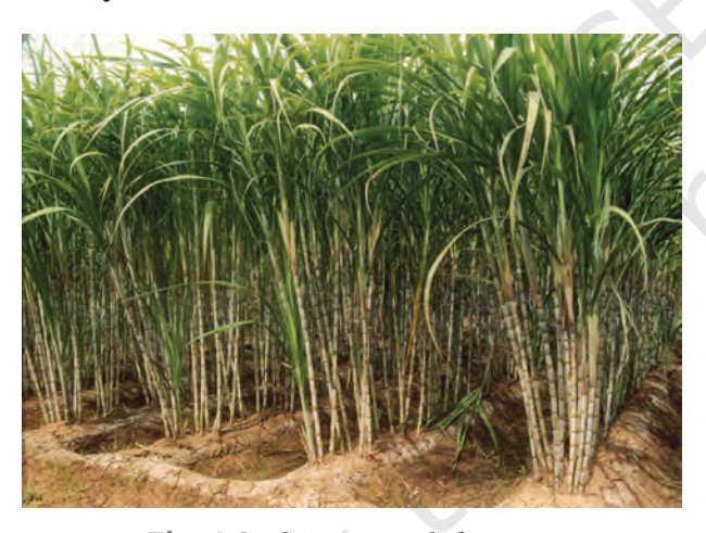
Fig. 4.8: Sugarcane Cultivation

Sugarcane: It is a tropical as well as a subtropical crop. It grows well in hot and humid climate with a temperature of 21°C to 27°C and an annual rainfall between 75cm. and 100cm. Irrigation is required in the regions of low rainfall. It can be grown on a variety of soils and needs manual labour from