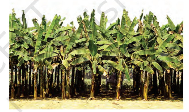
Fig. 4.2: Banana plantation in Southern part of India

In India, tea, coffee, rubber, sugarcane, banana, etc., are important plantation crops. Tea in Assam and North Bengal coffee in Karnataka are some of the important plantation crops grown in these states. Since the production is mainly for market, a well-developed network of transport and communication connecting the plantation areas, processing industries and markets plays an important role in the development of plantations.