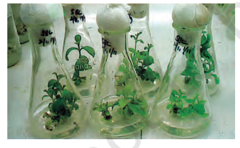
Fig. 4.16: Tissue culture of teak clones

countries because of the highly subsidised agriculture in those countries.