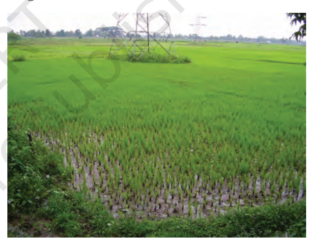
Fig. 4.4 (a): Rice Cultivation

Rice: It is the staple food crop of a majority of the people in India. Our country is the second largest producer of rice in the world after China. It is a kharif crop which requires high temperature, (above 25°C) and high humidity with annual rainfall above 100 cm. In the areas of less rainfall, it grows with the help of irrigation.