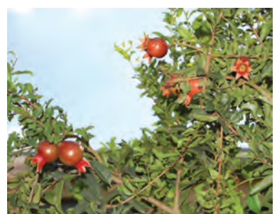
Fig. 4.12: Apricots, apple and pomegranate