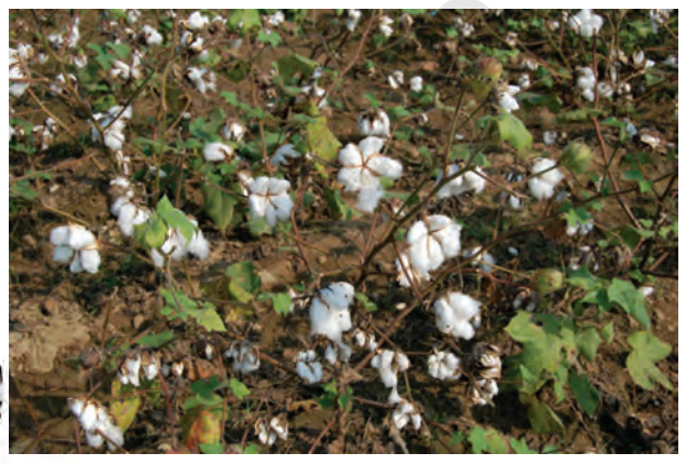
Fig. 4.14: Cotton Cultivation

Cotton: India is believed to be the original home of the cotton plant. Cotton is one of the main raw materials for cotton textile industry. In 2015, India was second largest producer of cotton after China. Cotton grows well in drier parts of the black cotton soil of the Deccan plateau. It requires high temperature, light rainfall or irrigation, 210 frost-free days and bright sun-shine for its