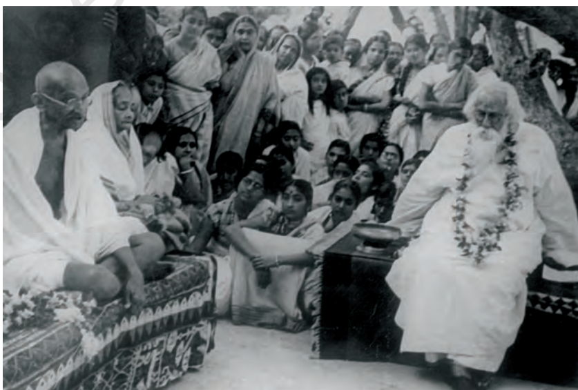
Fig. 10 – Mahatma Gandhi along with Kasturba Gandhi sitting with Rabindranath Tagore and a group of girls at Santiniketan, 1940

Western education, Mahatma Gandhi said, focused on reading and writing rather than oral knowledge; it valued textbooks rather than lived experience and practical knowledge. He argued that education ought to develop a person’s mind and soul. Literacy – or simply learning to read and write – by itself did not count as education. People had to work with their hands, learn a craft, and know how different things operated. This would develop their mind and their capacity to understand.