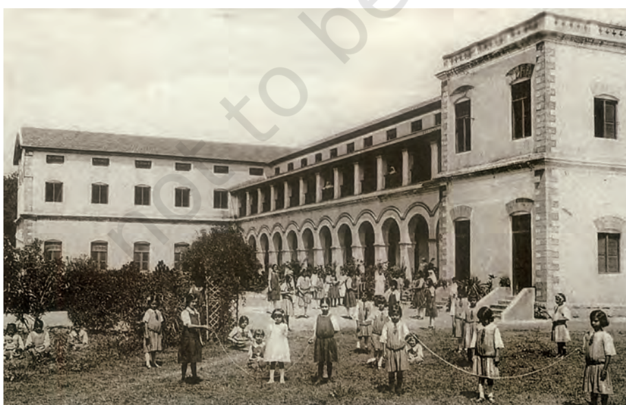
Fig. 12 – Children playing in a missionary school in Coimbatore, early twentieth century

Many individuals and thinkers were thus thinking about the way a national educational system could be fashioned. Some wanted changes within the system set up by the British, and felt that the system could be extended so as to include wider sections of people. Others urged that alternative systems be created so that people were educated into a culture that was truly national. Who was to define what was truly national? The debate about what this “national education” ought to be continued till after independence.