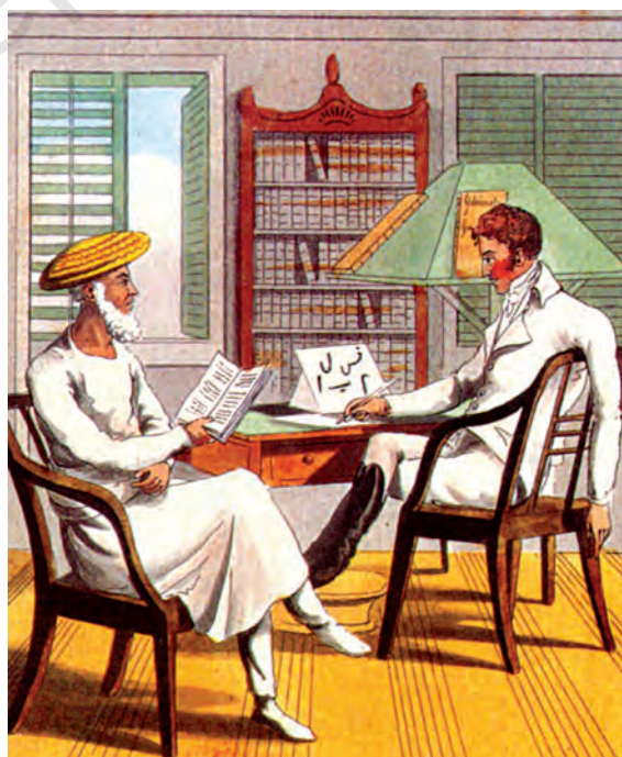
Fig. 1 – William Jones learning Persian

In 1783, a person named William Jones arrived in Calcutta. He had an appointment as a junior judge at the Supreme Court that the Company had set up. In addition to being an expert in law, Jones was a linguist . He had studied Greek and Latin at Oxford, knew French and English, had picked up Arabic from a friend, and had also learnt Persian. At Calcutta, he began spending many hours a day with pandits who taught him the subtleties of Sanskrit language, grammar and