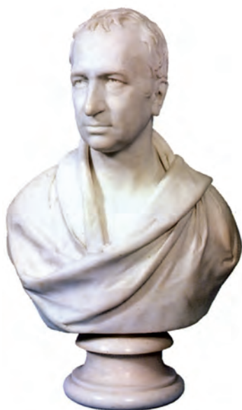
Fig. 2 – Henry Thomas Colebrooke

He was a scholar of Sanskrit and ancient sacred writings of Hinduism.