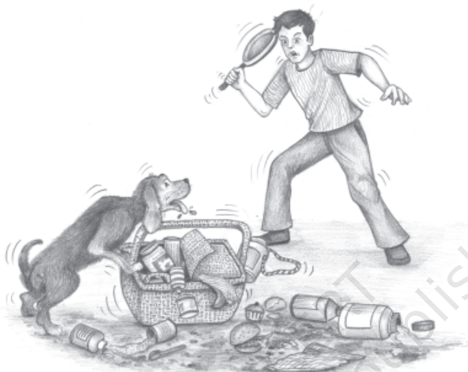
Montmorency got into the hamper ... before Harris could land him with the frying-pan.

things thrown at his head, then he feels his day has not been wasted.