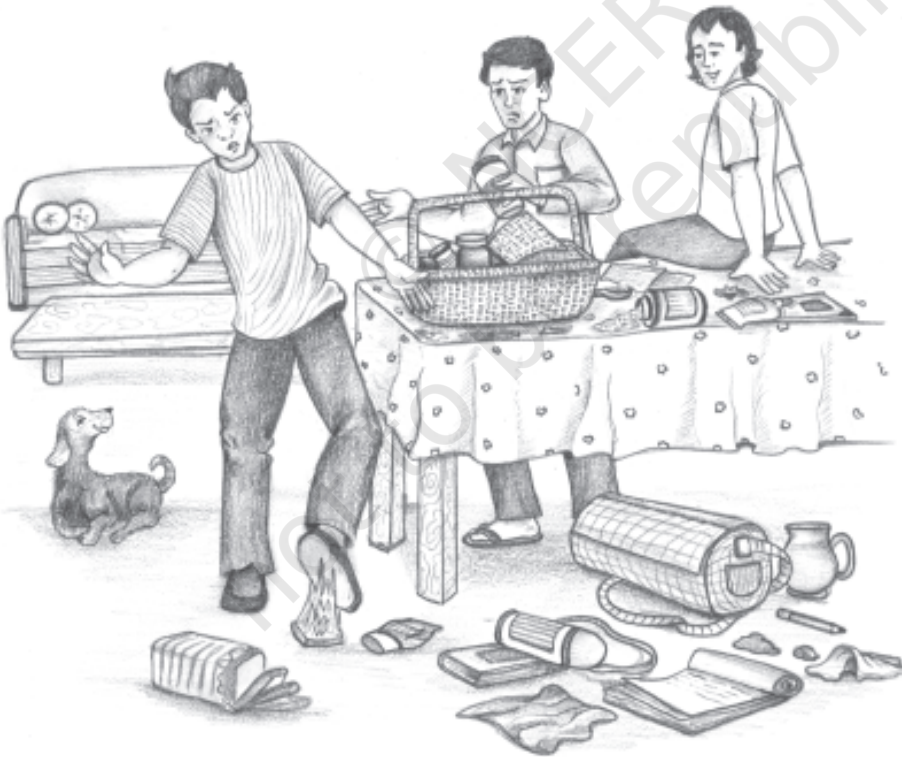
George trod on the butter.