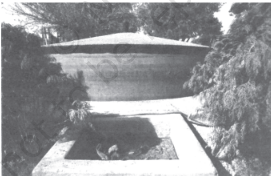
Fig.9.4 Gobar Gas Plant uses cattle dung to produce energy

Wind Power: In areas where speed of wind is usually high, wind mills can provide electricity without any adverse impact on the environment. Wind turbines move with the wind and electricity is generated. No doubt, the initial cost is high. But the benefits are such that the high cost gets easily absorbed.