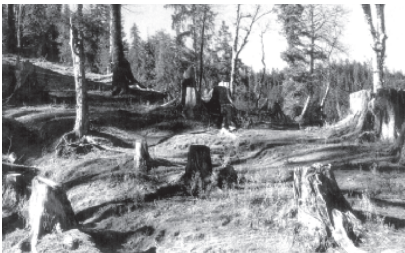
Fig. 9.3 Deforestation leads to land degradation, biodiversity loss and air pollution

India has abundant natural resources in terms of rich quality of soil, hundreds of rivers and tributaries, lush green forests, plenty of mineral deposits beneath the land surface, vast stretch of the Indian Ocean, ranges of mountains, etc. The black soil of the Deccan Plateau is particularly suitable for cultivation of cotton, leading to concentration of textile industries in this region. The Indo-Gangetic plains — spread from the Arabian Sea to the Bay of Bengal — are one of the most fertile, intensively cultivated and densely populated regions in the world. India's forests, though unevenly distributed, provide green cover for a majority of its population and natural cover for its wildlife. Large deposits of iron-ore, coal and natural gas are found in the country. India alone accounts for nearly 20 per cent of the world's total iron-ore reserves. Bauxite, copper, chromate, diamonds, gold, lead, lignite, manganese, zinc, uranium, etc. are also available in different parts of the country. However, the developmental activities in India have resulted in