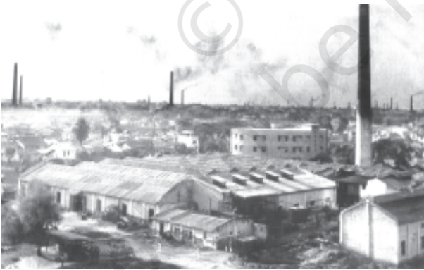
Fig. 9.2 Damodar Valley is one of India's most industrialised regions. Pollutants from the heavy industries along the banks of the Damodar river are converting it into an ecological disaster

But with population explosion and with the advent of industrial revolution to meet the growing needs of the expanding population, things changed. The result was that the demand for resources for both production and consumption went beyond the rate of regeneration of the resources; the pressure on the absorptive capacity of the environment increased tremendously — this trend continues even today. Thus what has happened is a reversal of supply-demand relationship for environmental quality — we are now faced with increased demand for environmental resources and services but their supply is limited due to overuse