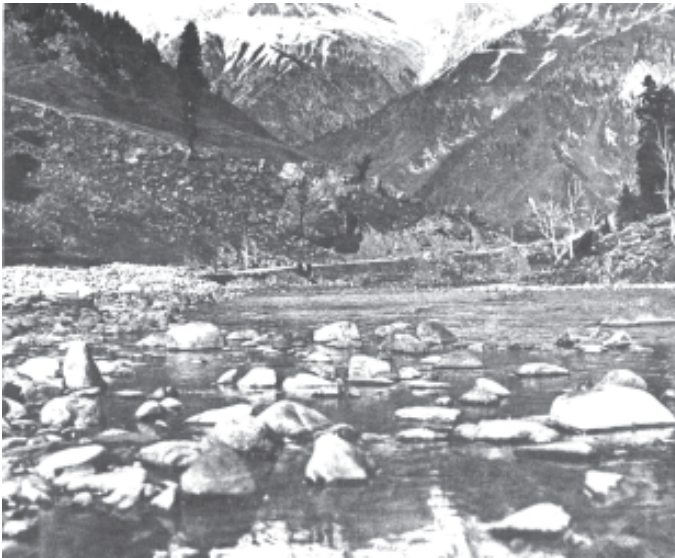
Fig. 9.1 Water bodies: small, snow-fed Himalayan streams are the few fresh-water sources that remain unpolluted.

this results in an environmental crisis. This is the situation today all over the world. The rising population of the developing countries and the affluent consumption and production standards of the developed world have placed a huge stress on the environment in terms of its first two functions. Many resources have become extinct and the wastes generated are beyond the absorptive capacity of the environment. Absorptive capacity means the ability of the environment to