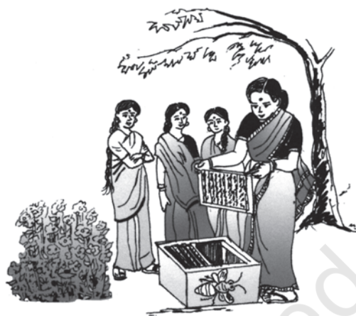
Fig. 6.5 Women in rural households take up bee-keeping as an entrepreneurial activity

Horticulture: Blessed with a varying climate and soil conditions, India has adopted growing of diverse horticultural crops such as fruits, vegetables, tuber crops, flowers, medicinal and aromatic plants, spices and plantation crops. These crops play a vital role in providing food and nutrition, besides addressing employment concerns. Horticulture sector contributes nearly one-third of the value of agriculture output and six per cent of Gross Domestic Product of India. India has emerged as a world leader in producing a variety of fruits like mangoes, bananas, coconuts, cashew nuts and a number of spices and is the second largest producer of fruits and vegetables. Economic condition of many farmers engaged in horticulture has improved and it has become a means of improving livelihood for many unprivileged classes. Flower