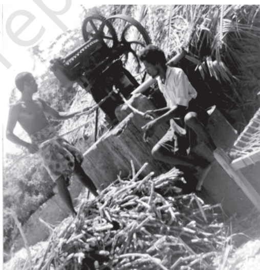
Fig. 6.2 Jaggery making is an allied activity of the farming sector

As agriculture is already overcrowded, a major proportion of the increasing labour force needs to find alternate employment opportunities in other non-farm sectors. Non-farm economy has several segments in it;