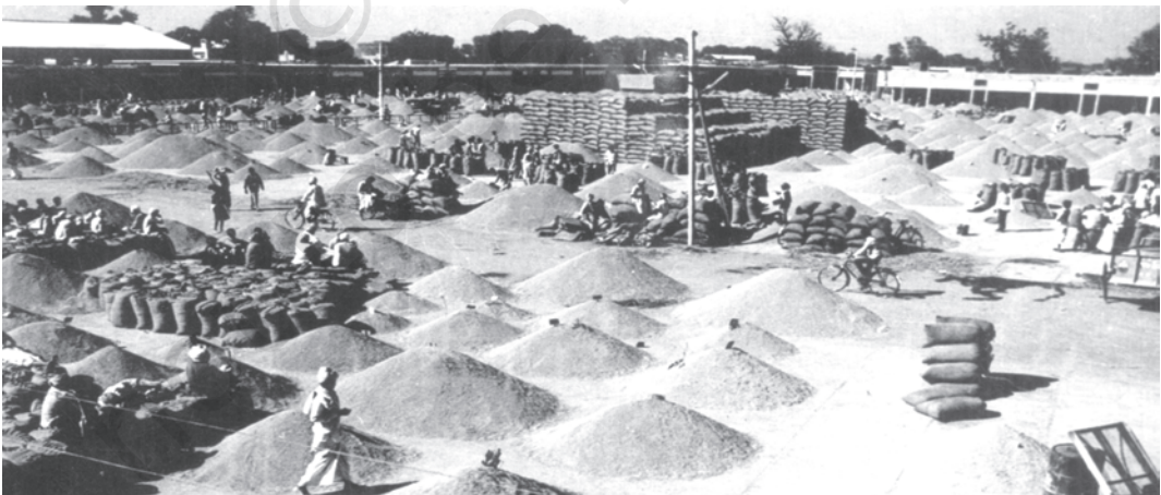
Fig. 6.1 Regulated market yards benefit farmers as well as consumers

Let us discuss four such measures that were initiated to improve the marketing aspect. The first step was regulation of markets to create orderly and transparent marketing conditions. By and large, this policy benefited farmers as well as consumers. However, there is still a need to develop about 27,000 rural periodic markets as regulated market places to realise the full potential of rural markets. Second component is provision of physical infrastructure facilities like roads, railways, warehouses, godowns, cold storages and processing units. The current infrastructure facilities are quite inadequate to meet the growing demand and need to be improved. Cooperative marketing, in realising fair prices for farmers' products, is the third aspect of government initiative. The success of milk cooperatives in transforming the