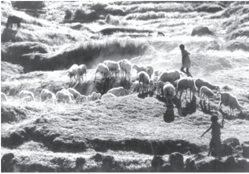
Fig. 6.3 Sheep rearing — an important income augmenting activity in rural areas

followed by others. Other animals which include camels, asses, horses, ponies and mules are in the lowest rung. India had about 300 million cattle, including 108 million buffaloes, in 2012. Performance of the Indian dairy sector over the last three decades has been quite impressive. Milk production in the country has increased by more than eight times between 1951-2014. This can be attributed mainly to the successful implementation of 'Operation Flood'. It is a system whereby all the farmers can pool their milk produced according to different grading (based on quality) and the same is processed and marketed to urban centres through cooperatives. In this system the farmers are assured of a fair price and income from the supply of milk to urban markets. As pointed out earlier Gujarat state is held as a success story in the efficient implementation of milk cooperatives which has been emulated by many states. Meat, eggs, wool and other by-products are also emerging as