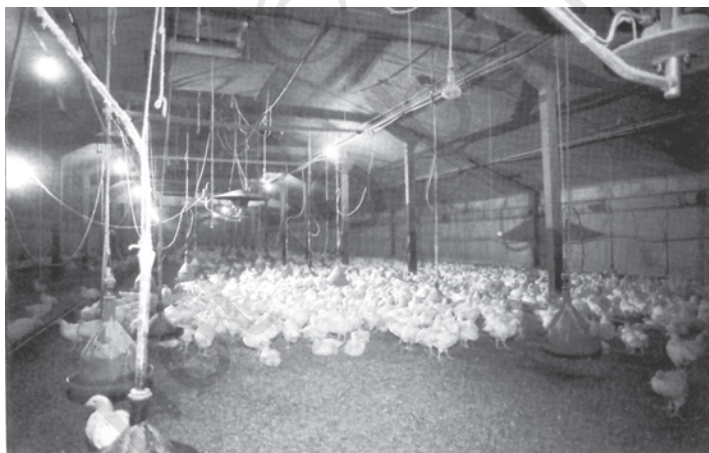
Fig. 6.4 Poultry has the largest share of total livestock in India

However problems related to over-fishing and