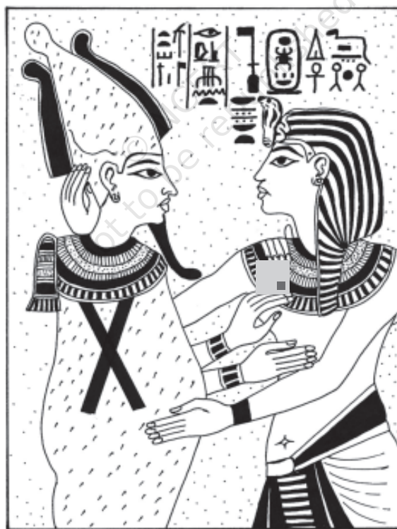
Mural in King Tut's tomb showing King Tut with Osiris, the god of the afterlife

Back in the trailer a technician pulled up astonishing images of Tut on a computer screen. A grey head took shape from a scattering of pixels, and the technician spun and tilted it in every direction. Neck vertebrae appeared as clearly as in an anatomy class. Other images revealed a hand, several views of the rib cage, and a transection of the skull. But for now the pressure was off. Sitting back in his chair, Zahi Hawass smiled, visibly relieved that nothing had gone seriously wrong. "I didn't sleep last night, not for a second," he said. "I was so worried. But now I think I will go and sleep."