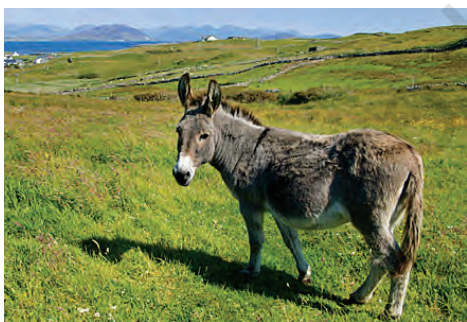
Figure 9.2 Mule

Interspecific hybridisation: In this method, male and female animals of two different related species are mated. In some cases, the progeny may combine desirable features of both the parents, and may be of considerable economic value, e.g., the mule (Figure 9.2). Do you know what cross leads to the production of the mule?