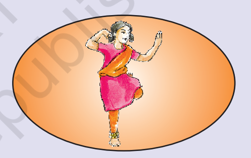
She is dancing.