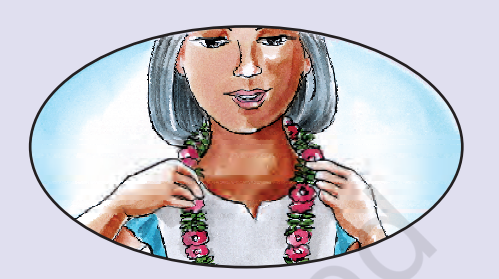
She is wearing a garland around her neck.