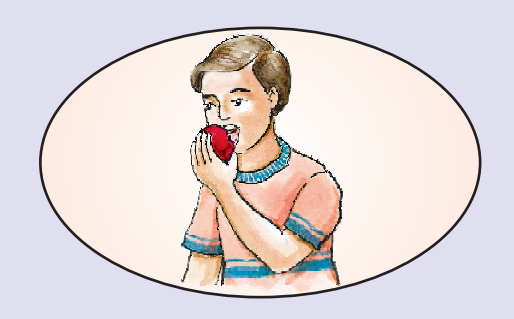
He is eating an apple.