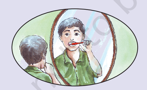
He is brushing his teeth.