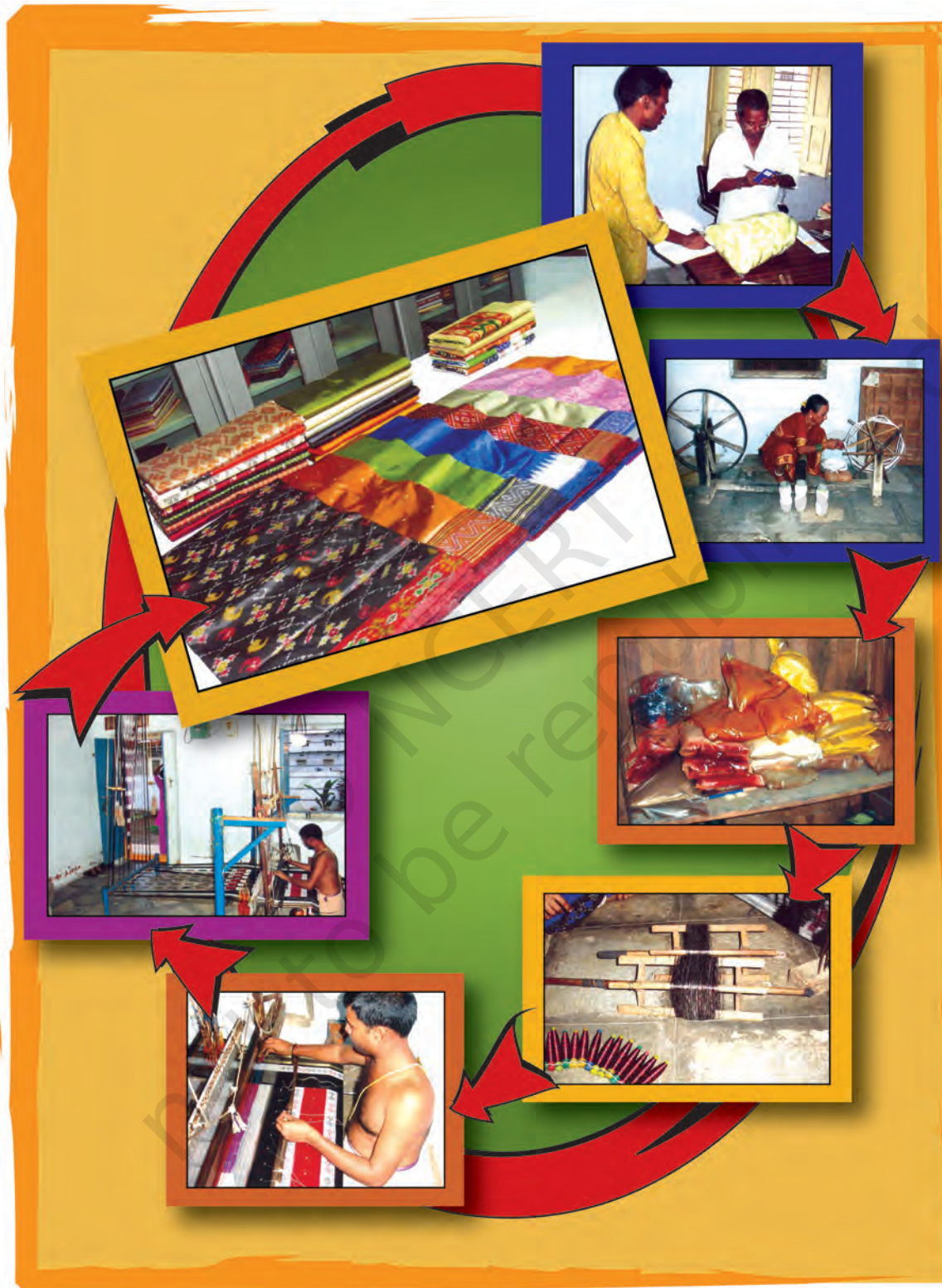
Process of making pochampalli sarees