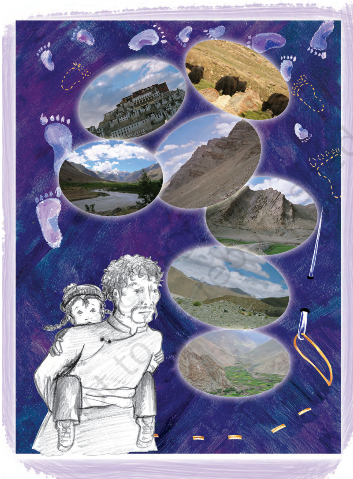
Chuskit amongst photographs from Ladakh