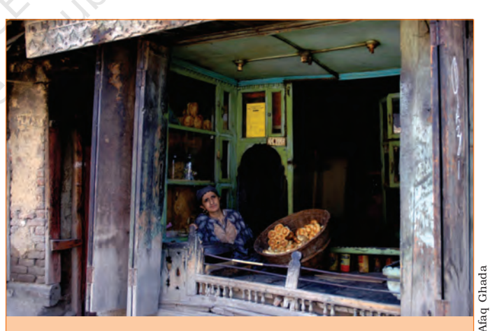
Can you tell what is shown in this picture? Every lane in Kashmir has a bakery. Kashmiri people don't cook roties in their homes, they buy it from such bakeries.

After a long journey Loner and I were about to reach Mumbai. My heart felt heavy. I also felt that my motorcycle did not want to come back. I was happy that I had learnt and experienced so many new things. I had also brought back some memories in my camera. And of course, this was not the end! Next time when Loner and I get bored of the city, we will again set out for a new journey!