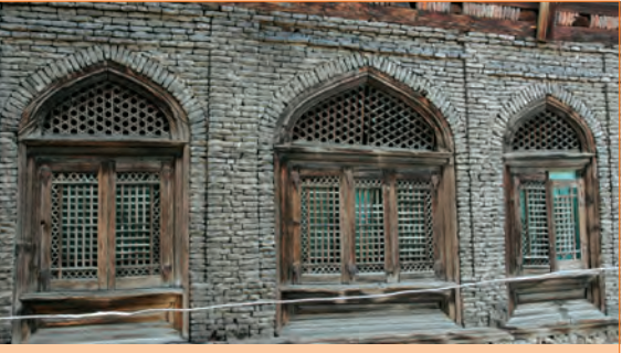
In villages of Kashmir, houses are made from stones cut and kept one on top of the other and coated with mud. Wood is also used. The houses have sloping roofs.