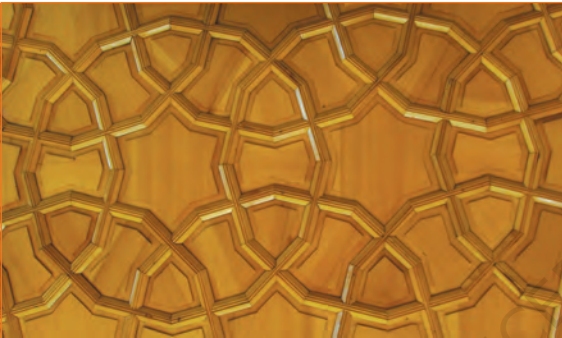
Beautiful carving on wood can be seen on the ceiling of houseboats and some big houses. This design is called 'khatamband', which has a pattern that look like a jigsaw puzzle.