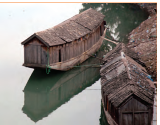
Many families in Srinagar live in a 'donga'. These boats can be seen in Dal Lake and Jhelum river. From inside the 'donga' is just like a house with different rooms.