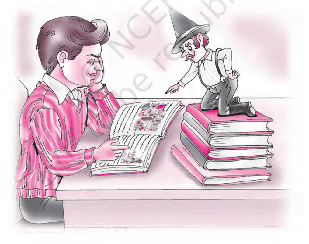
shrieked: gave a short, high-pitched cry

glitch (an informal word): a fault in a machine that prevents it from working properly; here, hitch or problem