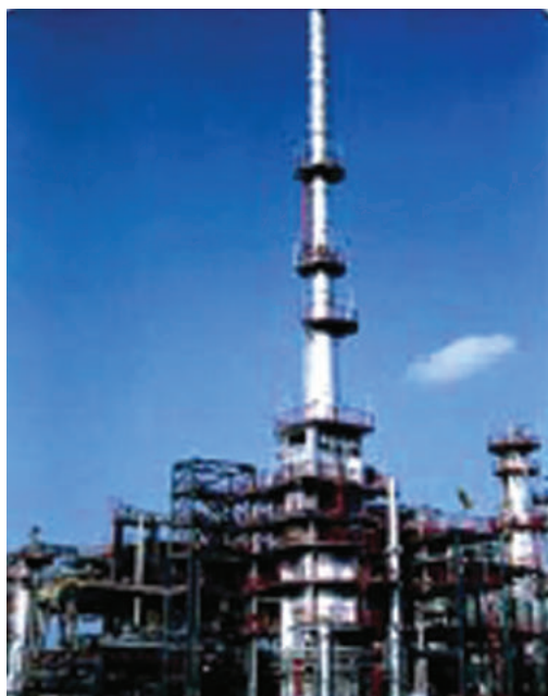
Fig. 5.5: A petroleum refinery

fractions of petroleum is known as refining. It is carried out in a petroleum refinery (Fig. 5.5).