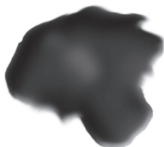
Fig. 5.3: Coal-tar

It is a black, thick liquid (Fig. 5.3) with unpleasant smell. It is a mixture of