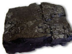
Fig. 5.1: Coal

You may have seen coal, or heard about it (Fig. 5.1). It is as hard as stone and is black in colour.