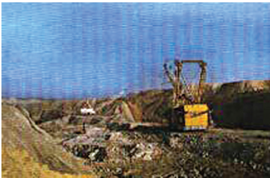
Fig. 5.2: A coal mine

When heated in air, coal burns and produces mainly carbon dioxide gas.