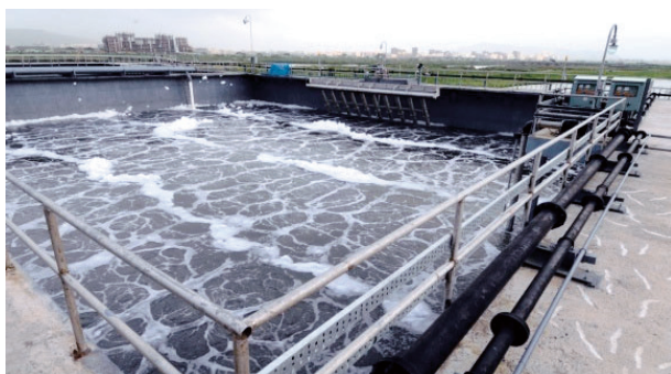
Figure 22.4 A view of sewage treatment plant Sewage/wastewater treatment method

The conventional wastewater treatment methods involve the following steps (a) Pre-screening (b) Aeration (c) Sludge Management and (d) Water Reuse.