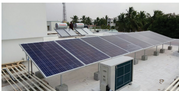
Figure 22.1 Solar Panel

Arrangement of many solar cells side by side connected to each other is called solar panel. The capacity to provide electric current is much increased in the solar panel. But the process of manufacture is very expensive.