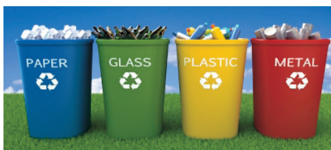
Figure 22.7 Collection of various types of solid wastes in separate bins