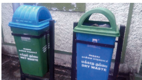
Figure 22.6 Collection of degradable and non-degradable solid wastes