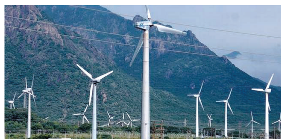
Figure 22.2 Windmill

Windmill is a machine that converts the energy of wind into rotational energy by broad blade attached to the rotating axis. When the blowing air strikes the blades of the windmill, it exerts force and causes the blades to rotate. The rotational movement of the blades operate the generator and the electricity is produced. The energy output from each windmill is coupled together to get electricity on a commercial scale.