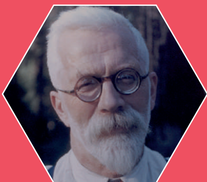
Sir Ronald Aylmer Fisher (AD (CE) 1890 - 1962)

Sir Ronald Aylmer Fisher was a British Statistician and Biologist. Also he was known as the Father of Modern Statistics and Experimental Design. Fisher did experimental agricultural research, which saved millions from starvation. He was awarded the Linnean Society of London's prestigious Darwin-Wallace Medal in 1958.