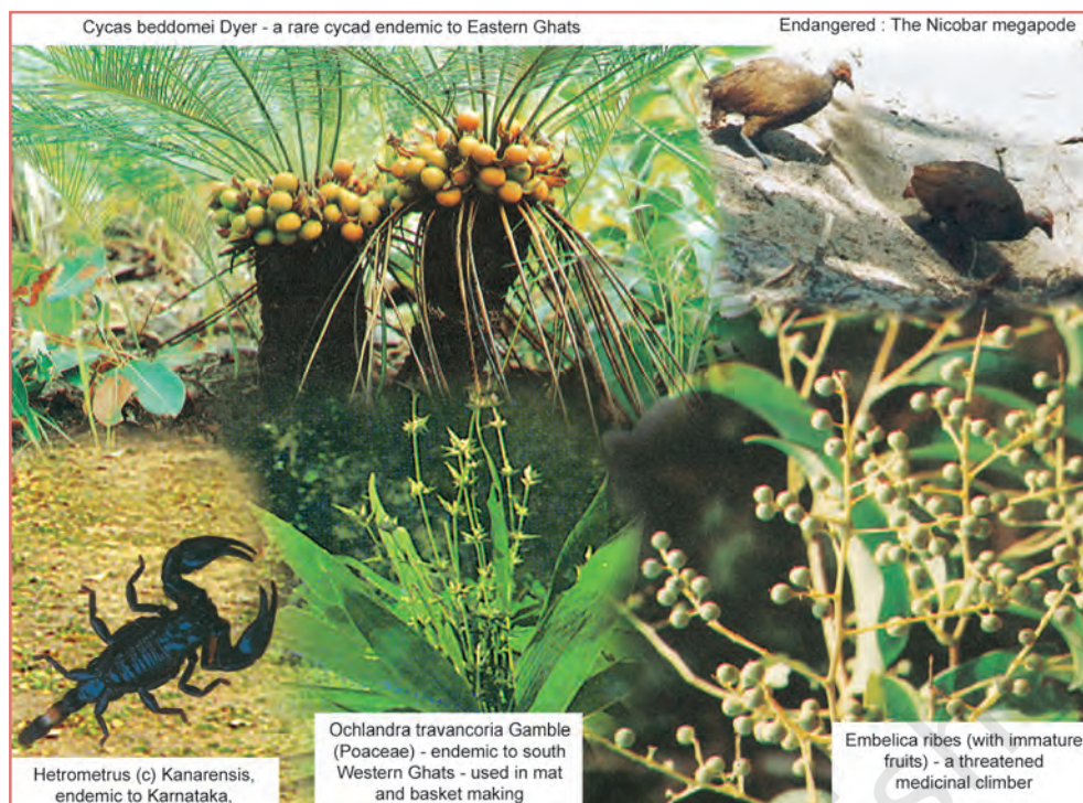
Fig. 2.2: A few extinct, rare and endangered species

a resource obtaining directly and indirectly from the forests and wildlife – wood, barks, leaves, rubber, medicines, dyes, food, fuel, fodder, manure, etc. So it is we ourselves who have depleted our forests and wildlife. The greatest damage inflicted on Indian forests was during the colonial period due to the expansion of the railways, agriculture, commercial and scientific forestry and mining activities. Even after Independence, agricultural expansion continues to be one of the major causes of depletion of forest resources. Between 1951 and 1980, according to the Forest Survey of India, over 26,200 sq. km. of forest area was converted into agricultural land all over India. Substantial parts of the tribal belts, especially in the north-eastern and central India, have been deforested or degraded by shifting cultivation (jhum), a type of 'slash and burn' agriculture.