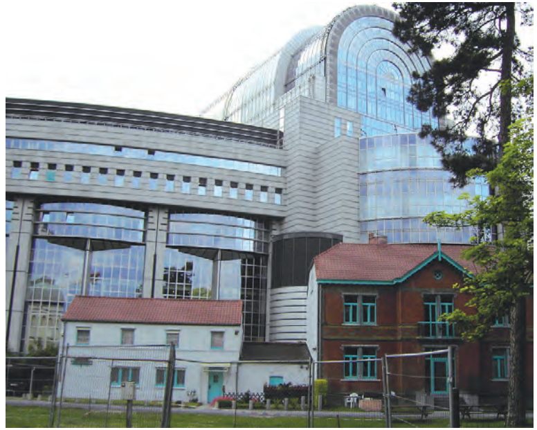
European Parliament in Brussels, Belgium

You might find the Belgian model very complicated. It indeed is very complicated, even for people living in Belgium. But these arrangements have worked well so far. They helped to avoid civic strife between the two major communities and a possible division of the country on linguistic lines. When many countries of Europe came together to form the European