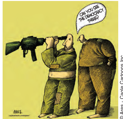
Seeing the democracy