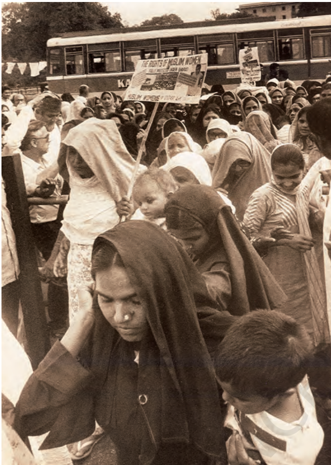
Women at a rally demanding their rights

discrimination had been practised in our society and how people had struggled against this. Many leaders of these struggles such as Dr Ambedkar had also fought for the rights of the Dalits.