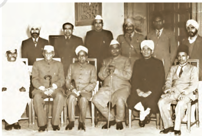
Some of the members who wrote the Constitution of India.

Therefore, India became a secular country where people of different religions and faiths have