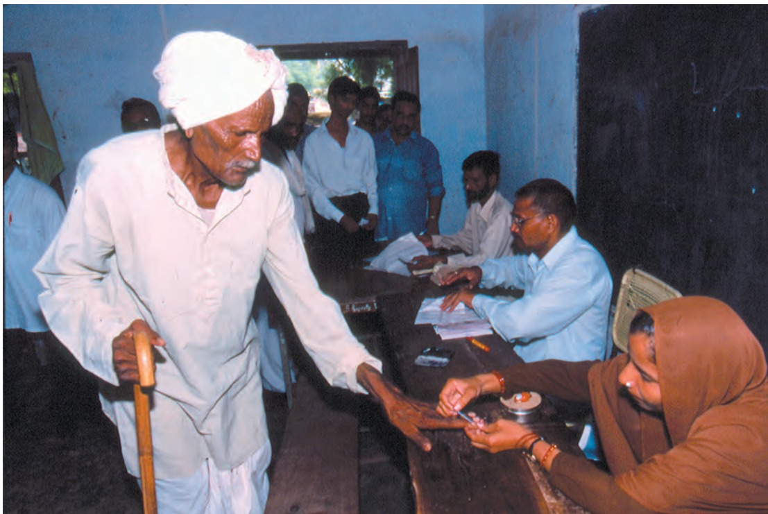
Voting in a rural area: A mark is put on the finger to make sure that a person casts only one vote.

decisions for the entire population. These days a government cannot call itself democratic unless it allows what is known as universal adult franchise. This means that all adults in the country are allowed to vote.