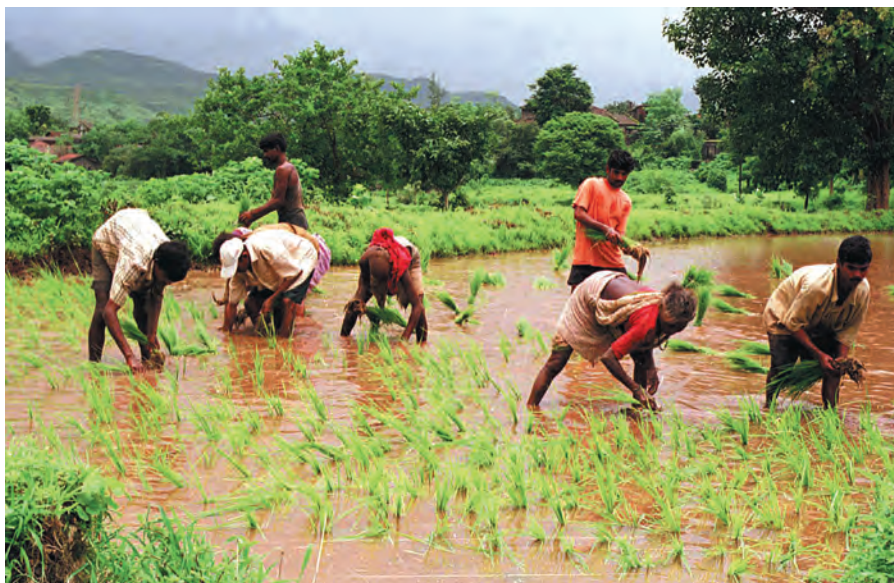
Transplanting paddy is back-breaking work.

The village is surrounded by low hills. Paddy is the main crop that is grown in irrigated lands. Most of the families earn a living through agriculture.