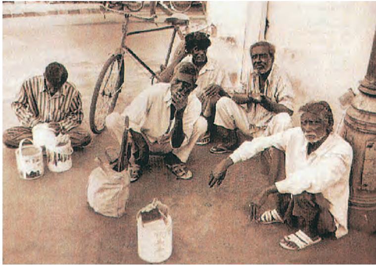
At labour chowk, daily wage workers wait with their tools for people to come and take them for work.

trucks in the market, dig pipelines and telephone cables and also build roads. There are thousands of such casual workers in the city.