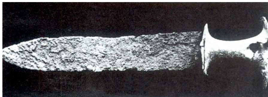
Below : A dagger.