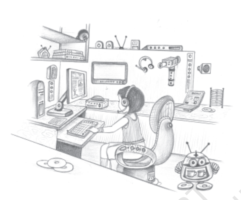
The mechanical teacher was flashing on the screen...

because her mother said little girls learned better if they learned at regular hours.