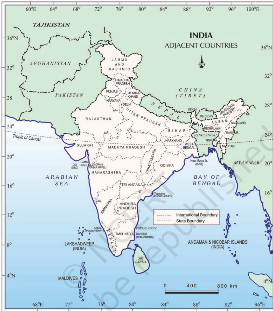
Figure 1.5 : India and Adjacent Countries

Sri Lanka and Maldives. Sri Lanka is separated from India by a narrow channel of sea formed by the Palk Strait and the Gulf of Mannar, while Maldives Islands are situated to the south of the Lakshadweep Islands.