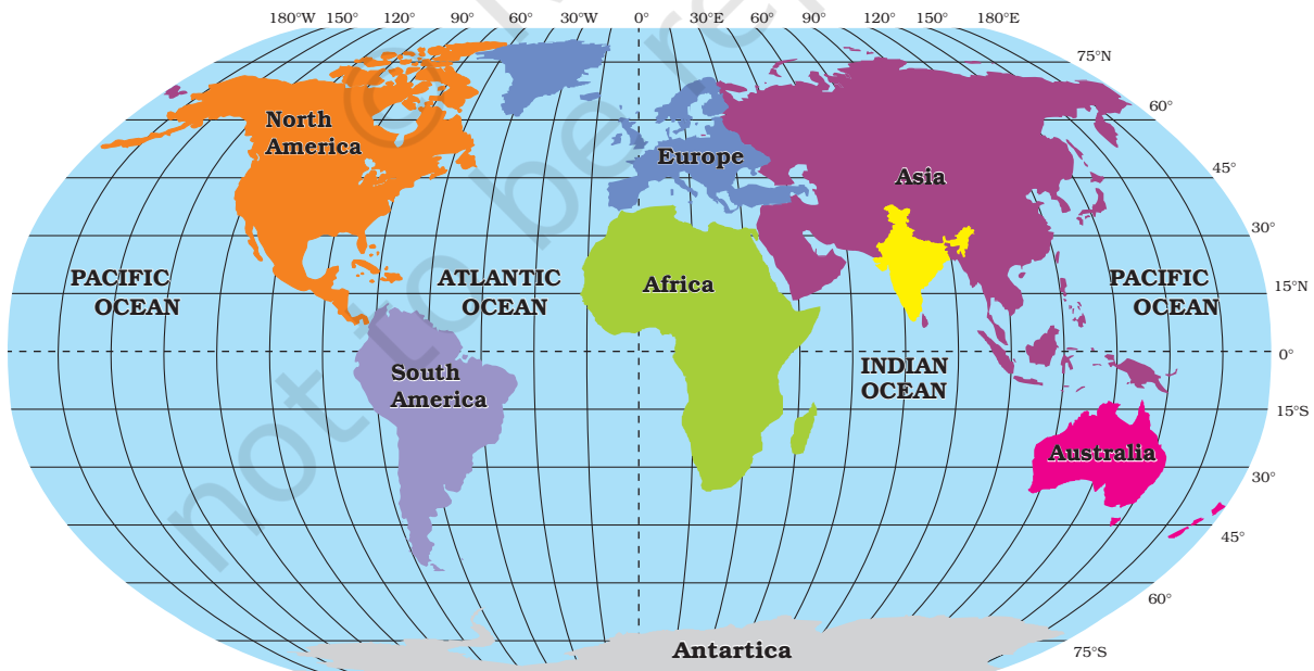
Figure 1.1 : India in the World

The land mass of India has an area of 3.28 million square km. India's total area accounts for about 2.4 per cent of the total geographical