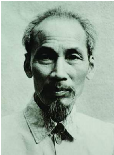
Fig 15.5 : Ho Chi Minh

Hanoi in September 1945. The Democratic Republic of Vietnam was formed and Ho Chi Minh became Chairman. When the Vietminh came to power in August 1945, they immediately issued a circular for a 25% reduction in land rents, the cancellation of all secondary rents, and the cancellation of all arrears in rent owed by tenants before August 1945. They also adopted the policy of redistributing communal land and land owned by French and Vietnamese traitors.