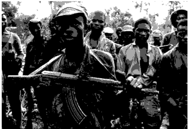
Fig 15.8 : Biafran war

domination of the north. Attempts were made repeatedly to bring in civilian and democratic governments but these failed again and again. Corruption and suppression of human rights went hand in hand with collaboration between the military regime and multinational Oil corporations which funded the corrupt rulers.