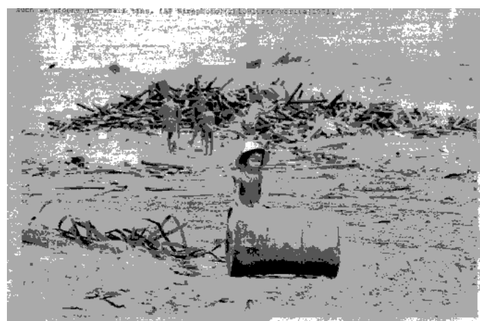
Fig 15. 6 : (a) US Army spraying chemical on trees. b) original caption of the picture: "A Use for Everything". Girl rolling drum. The metal will later be used for manufacturing small tins and spoons.