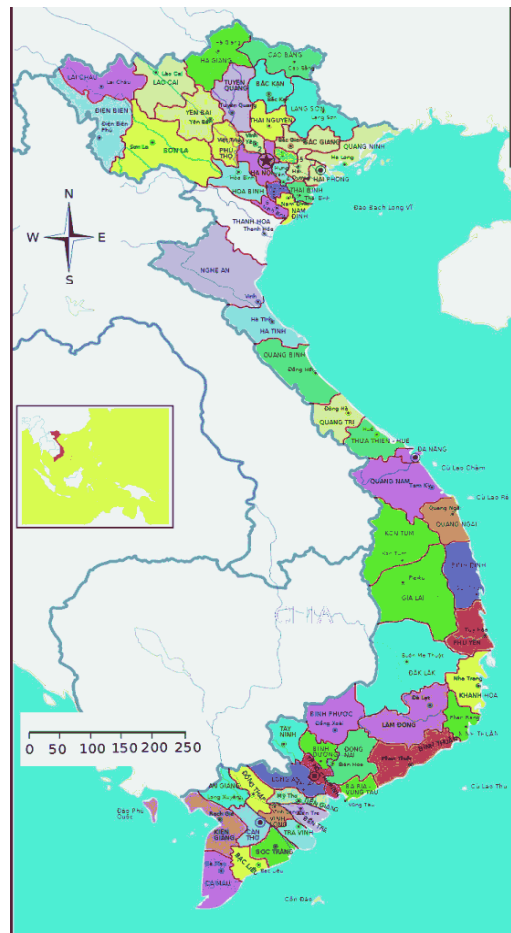
Map 2 : Vietnam

Decades of land expropriations and direct concessions to French colonists and the Vietnamese who sided with the French led to land being concentrated in the hands of large, wealthy landlords. Owning little or no land, Vietnamese peasants became entrenched in a cycle of debt, unable to break free from usury interest rates, exorbitant land rents, and suffocating taxes imposed by landlords who were also the village elites. Statistics on landlessness and landownership in the 1930s offer a devastating general picture of the harsh conditions faced by Vietnamese peasants. In Annam, in 1938 roughly 53% of families were completely landless. In Tonkin and Cochinchina, roughly 58% and 79% of families respectively were