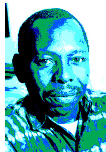
Fig 15.10 : Ken Saro Wiwa

Throughout the early 1990s popular unrest grew steadily, particularly in the Niger Delta region, where various ethnic groups began demanding compensation