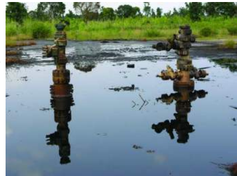
Fig 15.9 : Oil Spill

Oil was discovered in 1950s in the Niger Delta and soon various multinational companies headed by the Dutch Shell company acquired rights over oil drilling. Today it is the most important resource of Nigeria. Most of the oil wells are owned by these corporations which have extracted Nigerian oil and shared part of its profits with the military rulers. But the common people have benefitted little from this. In addition, reckless oil extraction without care for the environment by foreign oil companies has created havoc in coastal environment. Oil spillage from oil wells has a major impact on the ecosystem. Large tracts of the mangrove forests, which are especially susceptible to oil (this is mainly because it is stored in the soil and re-released annually with inundation), have been destroyed. An estimated 5–10% of Nigerian mangrove ecosystems have been wiped out either by clearing or oil. Spills destroy crops and aqua culture through contamination of the groundwater and soils. Drinking water is also frequently contaminated, and a sheen of oil is visible in many local bodies of water. If the drinking water is contaminated, even if no immediate health effects are apparent, it can cause in long term cancer. Offshore spills, which are usually much greater in scale, contaminate coastal environments and cause a decline in local fish production.