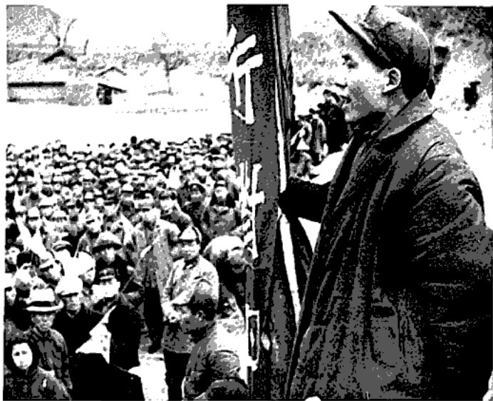
Fig 15.3 : Mao addressing people in Yanan, 1944

Guomindang. Mao Zedong's radical approach can be seen in Jiangxi, in the mountains, where they camped from 1928 to 1934, secure from Guomindang attacks. A strong peasants' council (soviet) was organised, united through confiscation and redistribution of land of landlords. Mao, unlike other leaders, stressed the need for an independent government and army. He had become aware of women's problems and supported the emergence of rural women's associations, promulgated a new marriage law that forbade arranged marriages, stopped purchase or sale of marriage contracts and simplified divorce.