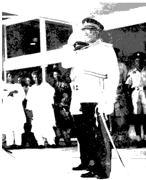
Fig 15.7 : Nnamdi Azikiwe

also supported militant attacks on the British colonial government. In 1936, the Nigerian Youth Movement (NYM) was founded by Nnamdi Azikiwe. It appealed to all Nigerians regardless of cultural background, and quickly grew to be a powerful political movement.