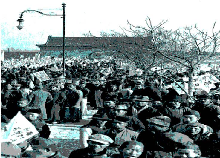
Fig 15.1 : People protesting in May fourth movement

The social and political situation continued to be unstable. On 4th May 1919, an angry demonstration was held in Beijing to protest against the decisions of the Versailles peace conference. Despite being an ally of the victorious side led by Britain, China did not get back the territories seized from it by Japan. The protest became a movement, called the “May Fourth Movement”. It galvanised a whole generation to attack old tradition and to call for saving China