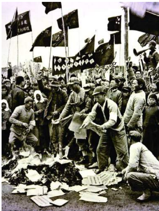
Fig 15.4 : People burning land records

After two years of relatively peaceful attempts at understanding rural situation, forming peasant associations etc, land reform proper was launched in 1950-1.