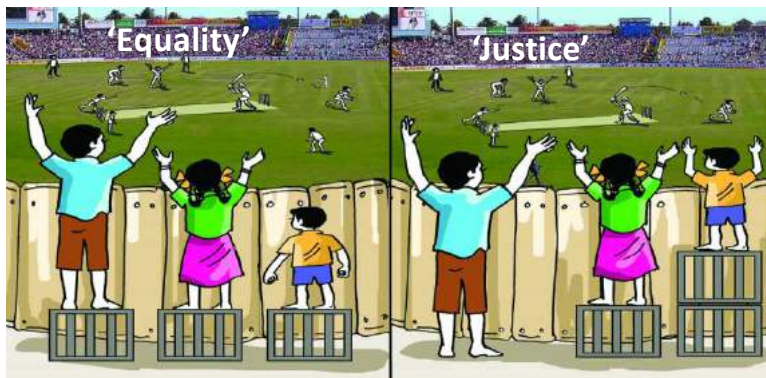
Fig 17.2 : Discuss the idea of equality and justice in this picture.

As you can see the Constituent Assembly (CA) was not elected through universal adult franchise, but indirectly and as such did not represent all sections of Indian society. Only about 10% of the population could vote in the provincial elections then. In fact the members from the princely states were not elected at all and were decided through consultation with the concerned princely states. Such a decision was taken keeping in view the special situation that had arisen due to intense political activity on the eve of freedom and mounting tensions among the people. The princely states had not yet agreed to become part of the Indian Union and many of them