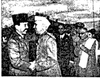
Dr. Soekarno, President of the United States of Indonesia, was received by Pandit Nehru and other Ministers when he arrived at the International Convention, New Delhi, on Tuesday to take part in the India Republic Day celebrations.