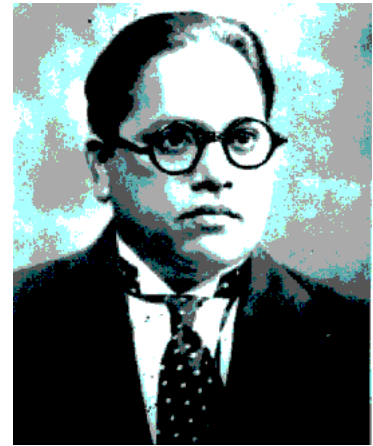
Fig 7.4: Dr. BR Ambedkar