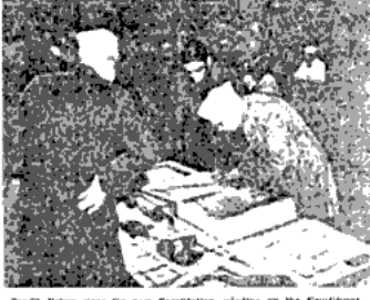
Pandit Nehru signs the new Constitution, signing at the Constituent Assembly in New Delhi.—A. G. S.