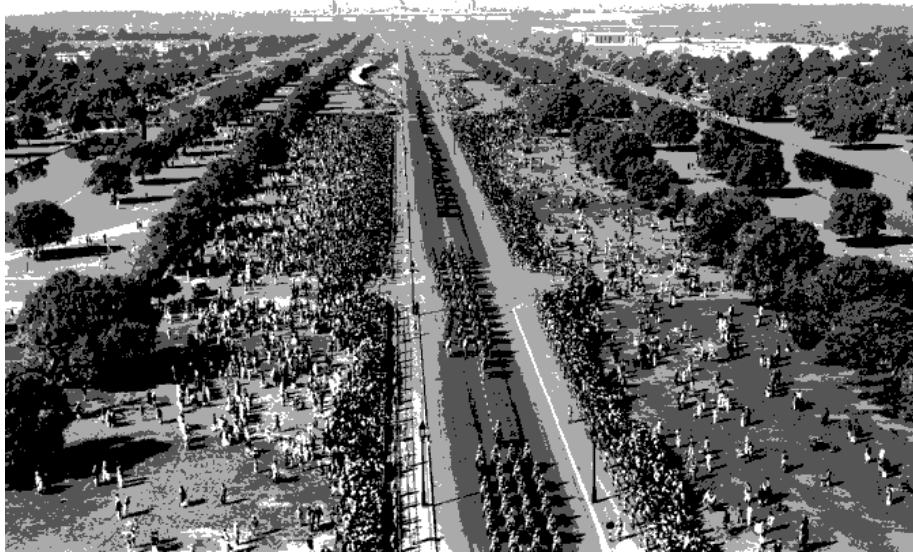
Fig 17.5 : An Aerial view of Republic Day from 1950's

“Care is taken to eliminate all diversity from laws which are at the basis of civic and corporate life. The great Codes of Civil & Criminal Laws, such as the Civil Procedure Code, Penal Code, the Criminal Procedure Code, the Evidence Act, Transfer of Property Act, Laws