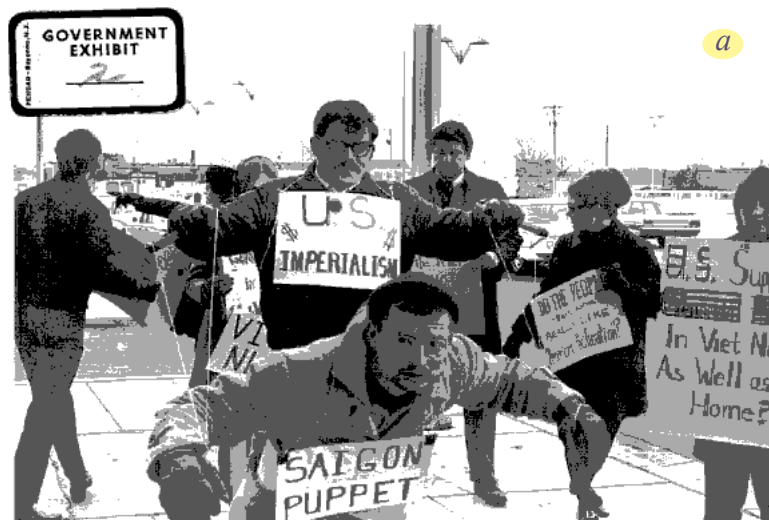
Fig 21.3: a. Vietnam War protesters; b. female demonstrator offers a flower to military police on guard at the Pentagon. Discuss the ideas in these images.

As a result of these pressures the USA and USSR, the main competitors in the arms race, began talks to cut down their nuclear arsenal - Strategic Arms Limitation Talks (SALT) which however were unsuccessful. Finally a treaty was signed in 1991 which is called Strategic Arms Reduction Treaty (START). START negotiated the largest and most complex arms control treaty in history, and its final implementation in late 2001 resulted in the removal of about 80 percent of all strategic nuclear weapons then in existence. A little after the signing of the treaty the USSR was dissolved and in its place a new Russian state was formed. With this ended the long period