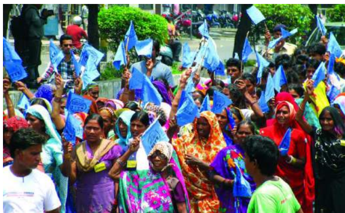
Fig. 21.5 Protest in Narmada valley against

Initially the Sardar Sarovar Project was expected to be built with money borrowed from World Bank. After intense protests, mobilisation, marches, hunger fasts and an international campaign World Bank decided to withdraw its funding.