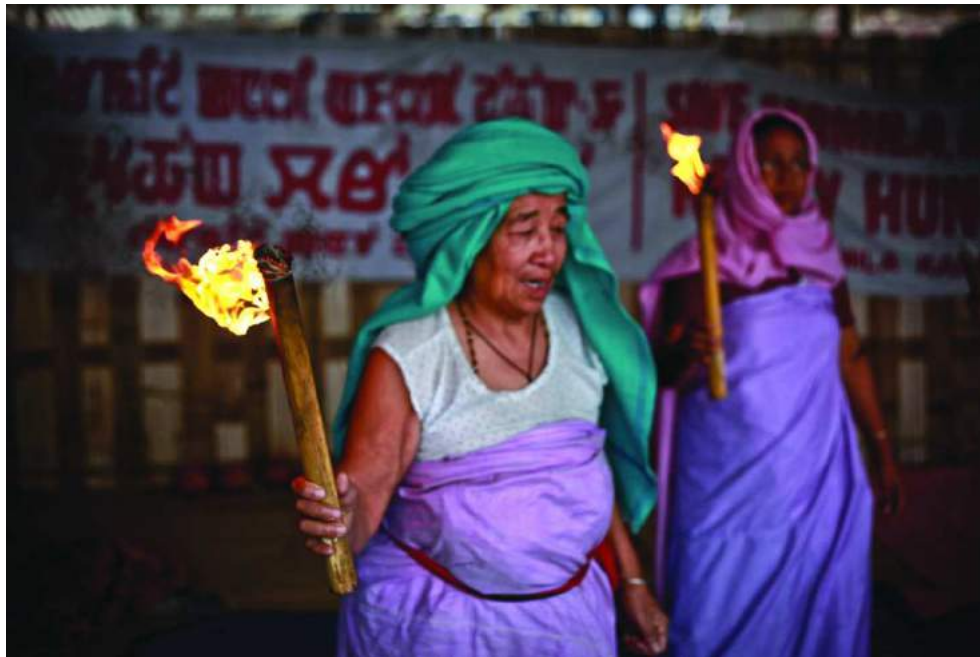
Fig. 21.8 : Meira Paibi Women in a rally

AFSPA be revoked. Gradually, the movement against this Act has grown in strength and women have expressed their struggle in different forms from boycott of elections to sitting on relay hunger strikes. One amongst them Irom Sharmila has been on hunger strike for more than 10 years and is under house arrest.