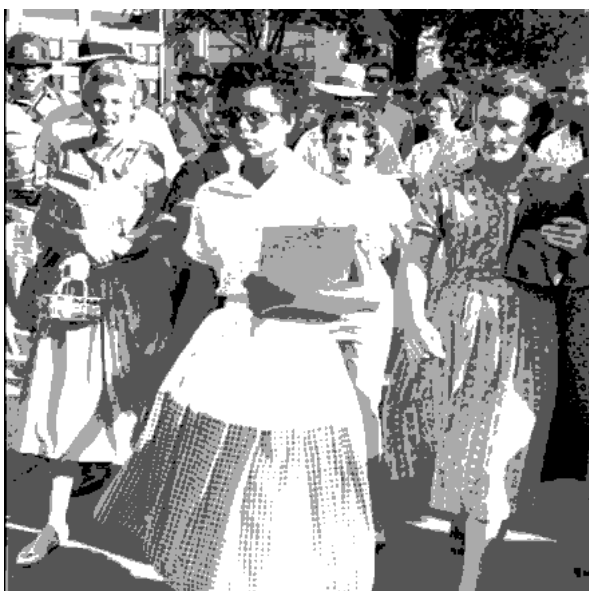
Fig 21.1 : Photograph by Will C. of Elizabeth Eckford a black girl attempting to enter Little Rock School on 4th September 1957.

The world during the first half of the 20th century was dominated by the great wars, revolutions, emergence of German Fascism, Soviet Socialism, Western liberalism, national liberation movements etc. However, with the end of the Second World War and the independence of colonies and semi-colonies like India, China, Indonesia, Nigeria and Egypt by mid 1950's a new era began in the world. This was an era of economic growth and prosperity for most of the countries, but also of growing tensions in many countries. Sections of societies which had long been denied equal rights came out asserting their rights.