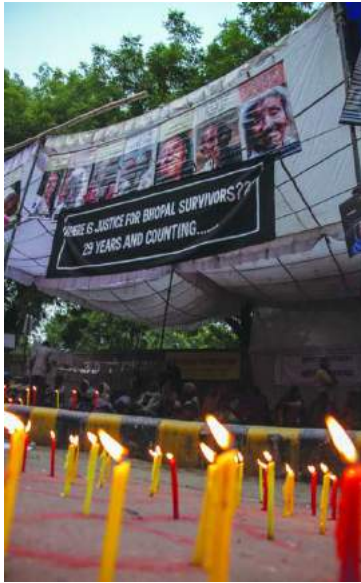
Fig. 21.4 Bhopal gas tragedy being commemorated

While they have succeeded to some measure, they are still a long way before they can claim to have achieved all the major demands. While enormous sums have been spent on setting up medical facilities in Bhopal, the victims are still suffering from its effects; compensation has been paid not as per international standards and that too not properly to all the affected people; the government failed to prosecute and punish the management of the company for its negligence which led to the accident. We do have better laws today, yet we still do not have a proper policy or adequate impartial inspecting mechanism which will eliminate the possibility of such disasters in the future. The protest against this has been even more complex since the company itself was based in USA. People today need to use international laws to fight against the problems that the factory workers and women who are affected by the pollution created by the company. Many people across the globe boycotted products made by the company. Today social mobilisation continues when the Dow company sponsored Olympics in London and people across the globe signed petition against it. Multiple organisations from around the world pointed at the unethical alliance of Olympic body with Dow.