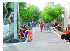
Fig: 14.6. 'Nagara Deepikas' at work in Tenali. Do you think it is safe for them to collect garbage with bare hands?

time everyday. A sustained campaign has ensured that all houses adhere to this habit of separating their waste in two buckets. The recyclable dry waste is sold at Rs.3 a kg to a private buyer. The wet waste is also used for making compost. Out of 100 tonnes of garbage collected, 40 tonnes are sold for recycling generating a revenue of Rs.15 lakh per annum. Tenali municipality has won several awards for this programme. The other municipalities are also slowly adopting similar type of effective practices for disposal of garbage.