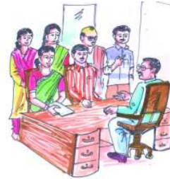
Fig: 14.5 submission of a letter to authorities for sanitation