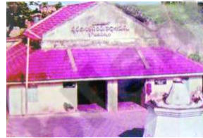
Fig: 14.2 Bheemunipatnam Municipality 122 Social Studies

Like the village panchayats the municipalities too are formed through elections. Urban areas are also divided into wards and people are elected as representatives. These representatives are called Councillors in municipal towns and corporators in Corporation cities. Apart from the ward Councillors there are also Mayors, or Chairpersons who head the institution like the Sarpanches in the Panchayats.