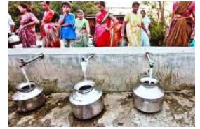
Fig: 14.3 Drinking water