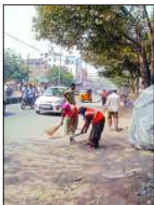
fig: 14.4. Sanitation work

The municipality has a lot of tasks to perform like water supply, street lighting, maintaining and building roads, drainage and garbage disposal, running schools, ration shops, hospitals etc., besides taking up new developmental works. Now all this cannot be done by a few people or by the Corporators or Councillors alone. For this purpose the municipalities employ a large number of workers, officers and clerks and accountants. Each municipality has a number of departments, each headed by an officer who is responsible for the proper work of the staff related to that department.