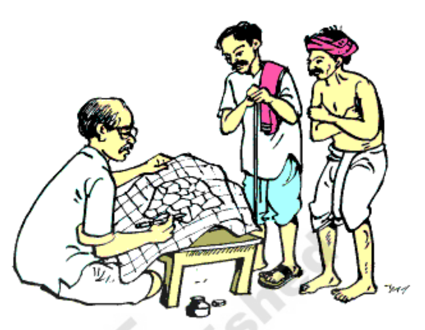
Fig 19.3 Village Accountant with land records

perennial rivers and forest areas. Yet today we find in many parts of Andhra Pradesh that borewells are dug up to 1,500 feet or more. In the long run it may not be viable to have such system of irrigation, or drinking water.